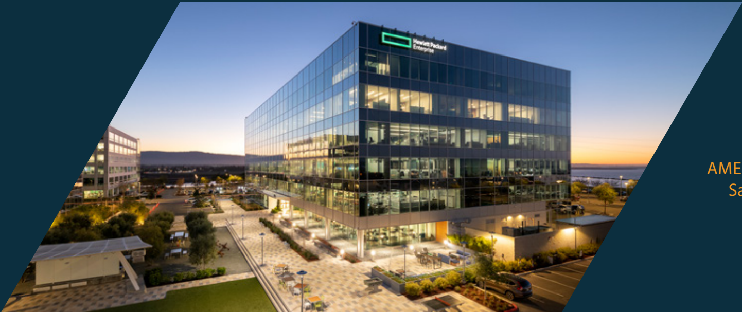
AMERICA CENTER San Jose, CA

Affinius Capital® (previously known as USAA Real Estate and Square Mile Capital Management) is a recognized leader in institutional real estate investment, dedicated to value-creation and income generation. Leveraging our impressive 40-year track record and $32 billion in net assets under management, we are driven forward by a spirit of innovation. We thrive on understanding how technology and shifting demographics are reshaping real estate demand. Our life science portfolio of over 5.3 million square feet reinforces our position at the cutting edge of the industry.