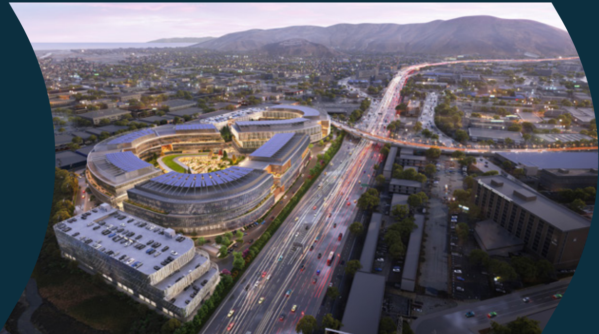
INFINITE South San Francisco, CA

We create platforms for life-changing discoveries