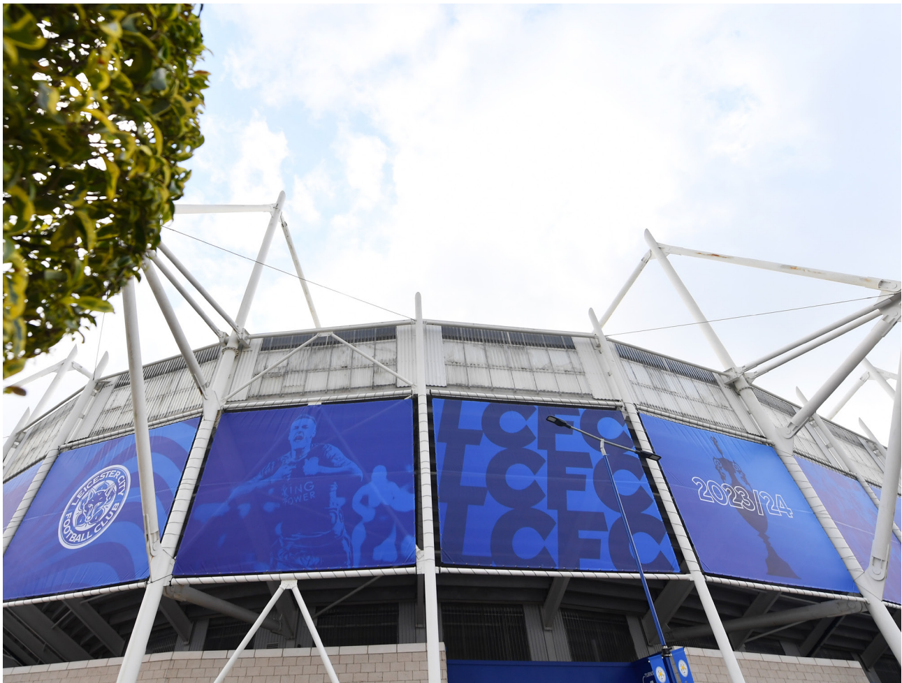
Image: King Power Stadium

For details on routes to Leicester, visit travelineeastmidlands.co.uk