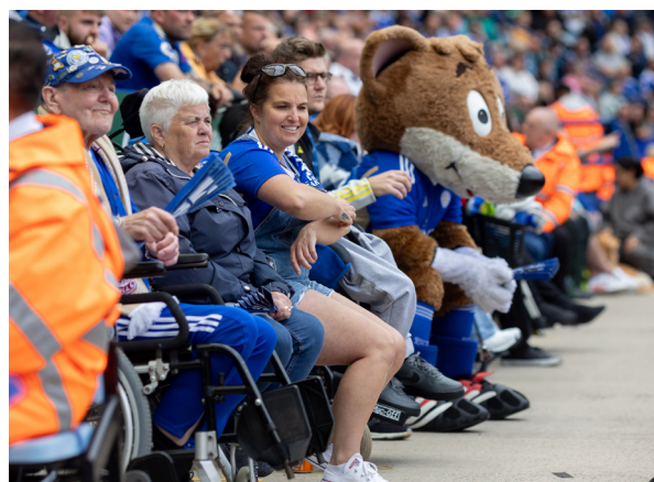
Images: Supporter viewing areas