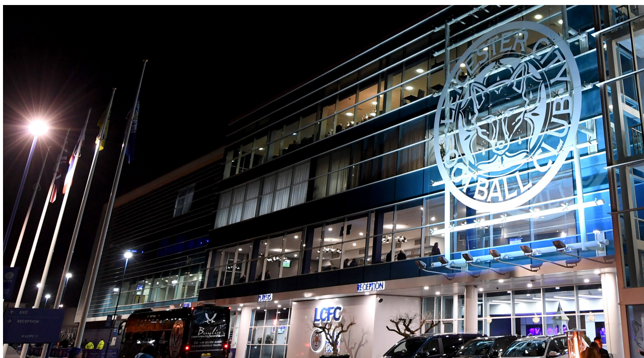
Image: Outside the reception of King Power Stadium at night