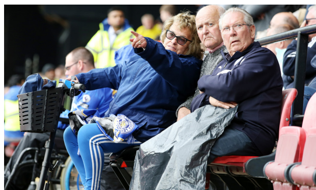
Images: LCFC Fans attending away fixtures