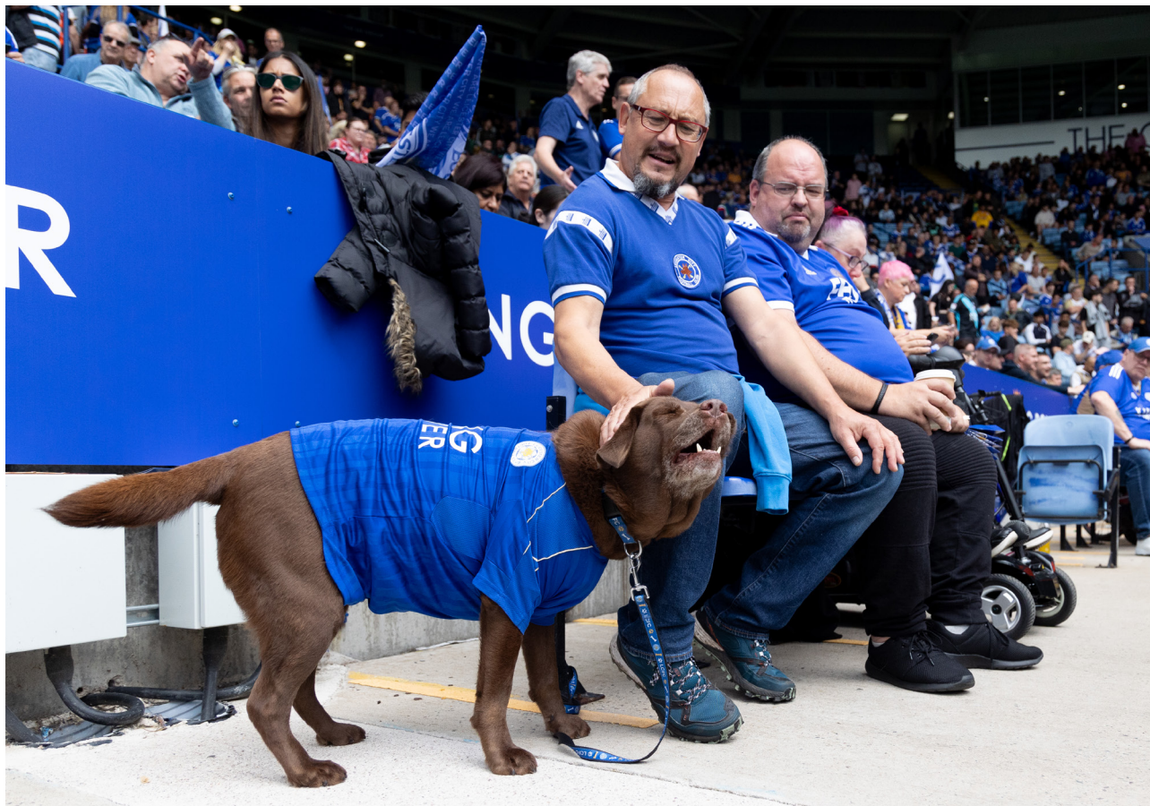
Image: Supporters pitchside