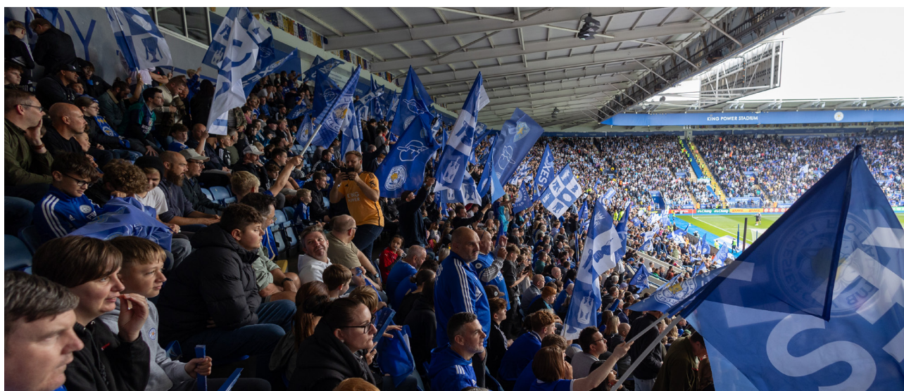
Image: Fans waving flags