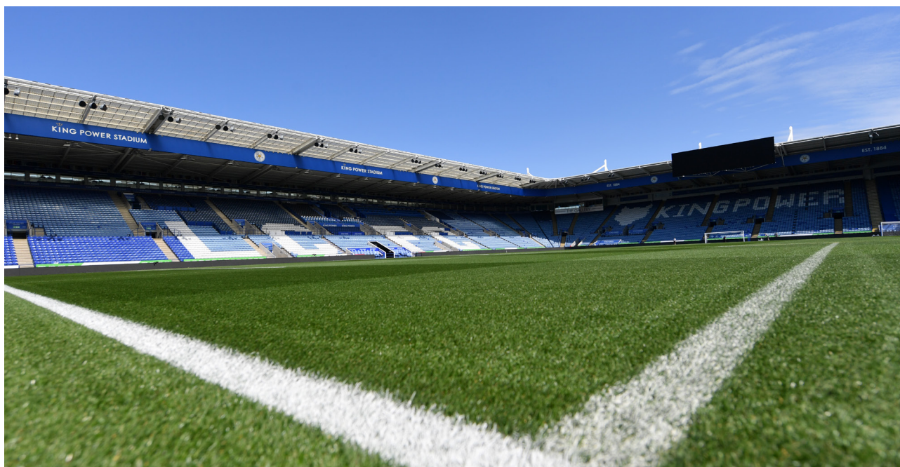
Images: King Power Stadium view of the pitch

If you are reporting a hate crime, please text 'FOXES' followed by your message, seat number and the nature of your concern to 6066.