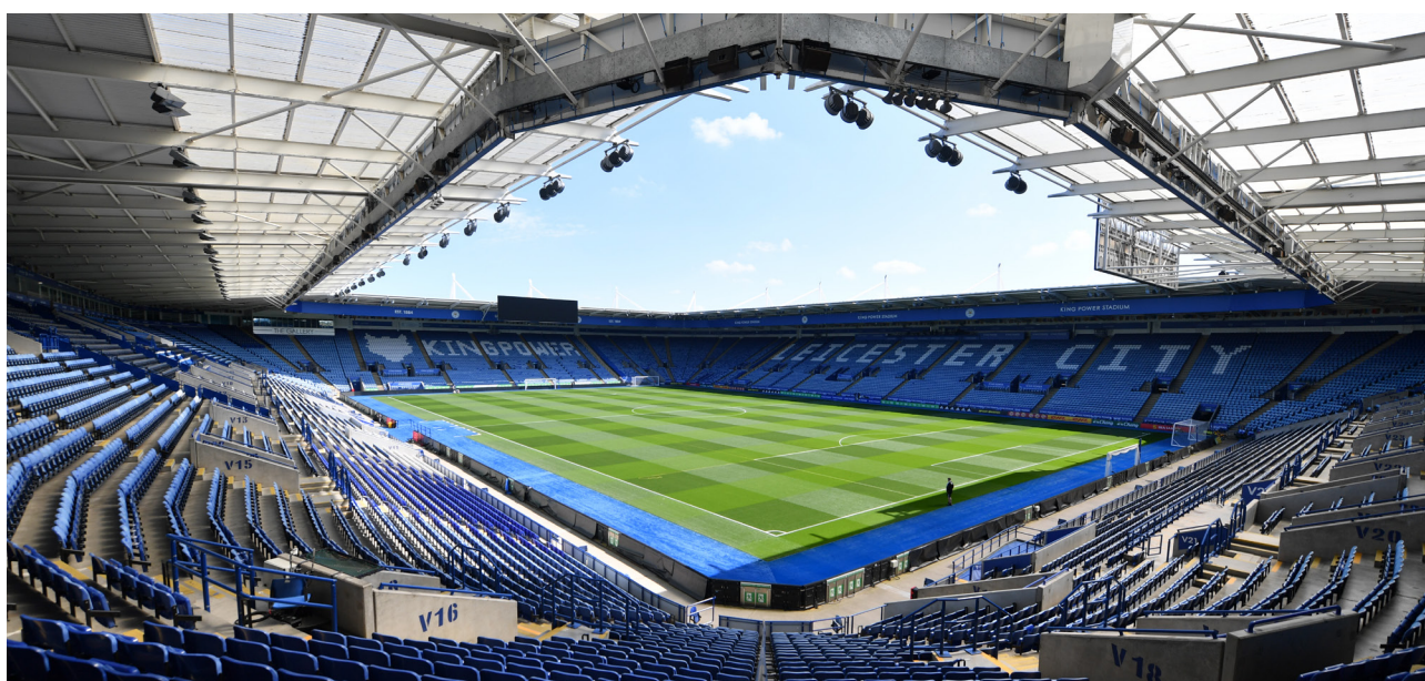
Images: King Power Stadium view of the pitch

Visit the Foxes Fanstore at King Power Stadium