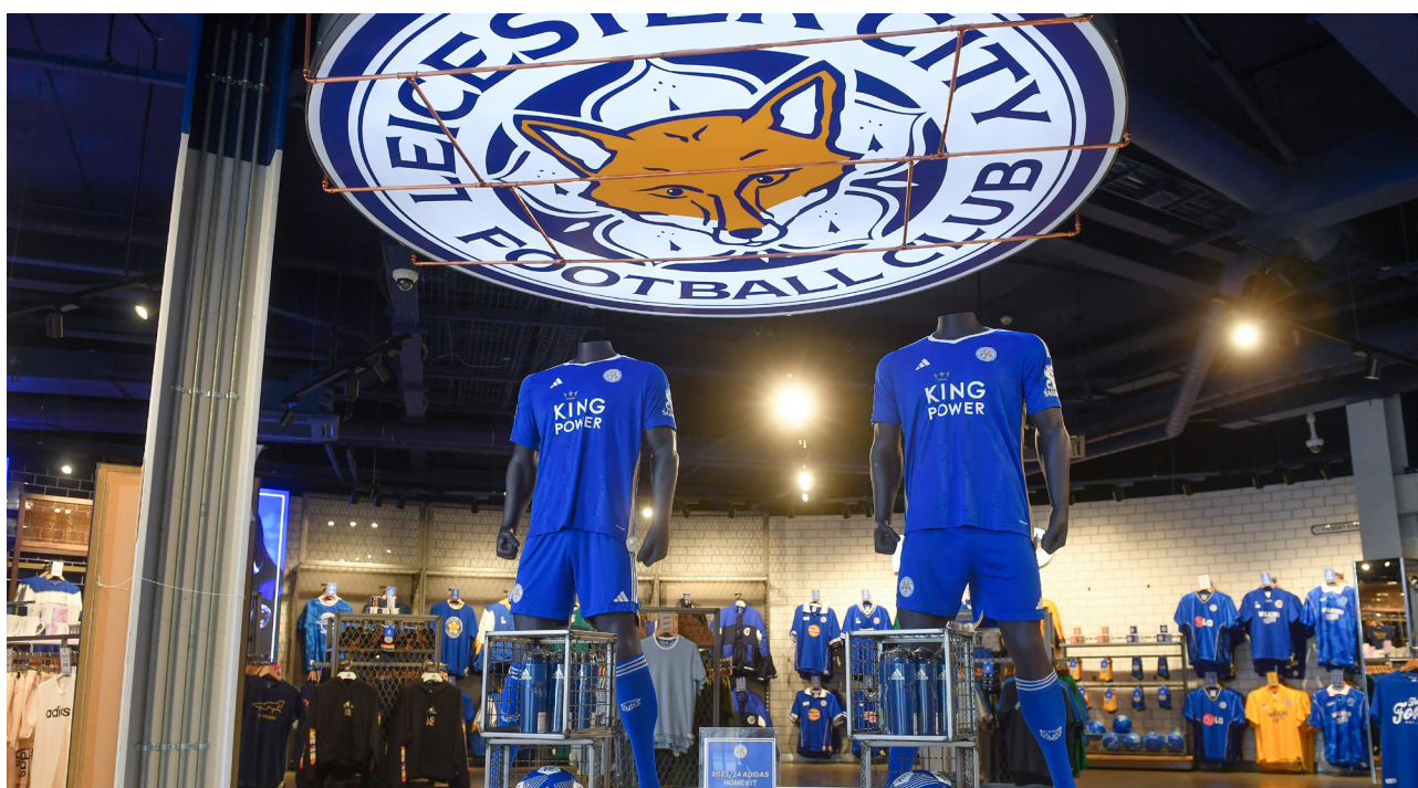
Image: Home shirts in the Foxes Fanstore

* Bank Holiday hours may vary. Please check LCFC.com.