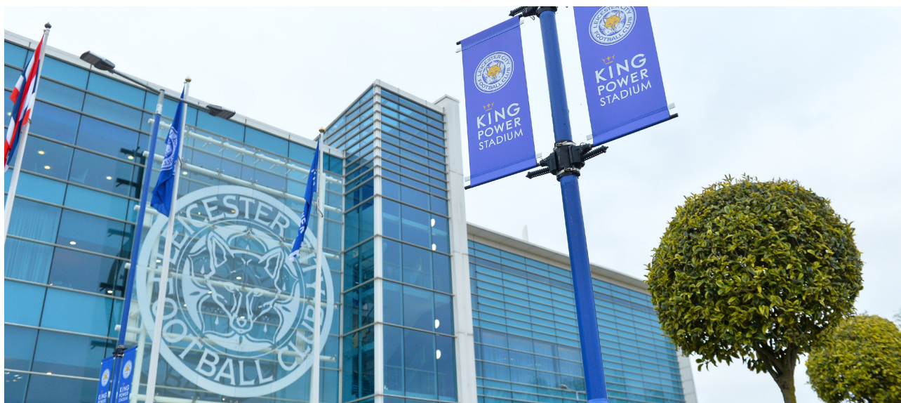
Image: Outside the reception of King Power Stadium