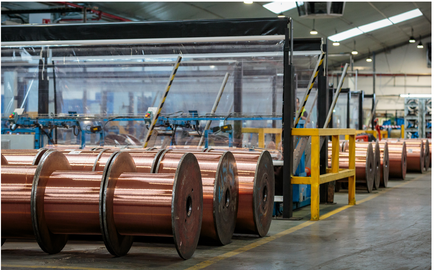
The Cables RCT production system has the most up-to-date equipment for the manufacture of insulated electrical cables for low voltage. Cables RCT is a supplier of cables for everyday use and cables for all industries.

Using its extensive catalog of products and solutions, Siemens helped Cables RCT overcome its cybersecurity challenges and improve its infrastructure. One of the key elements in the solution was the SINEMA Remote Connect connectivity management platform. "This software, designed for remote access management and connectivity in the plant, provides a secure and scalable solution that guarantees access to machines, mitigating cybersecurity risks," says Edgar