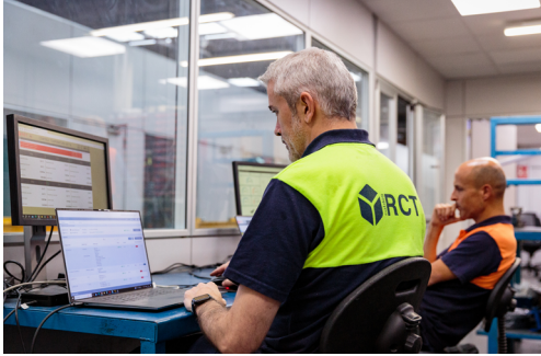
Cables RCT maintenance personnel using the SINEMA Remote Connect tool. Thanks to the solution chosen, machines can now be accessed from both inside and outside the factory.