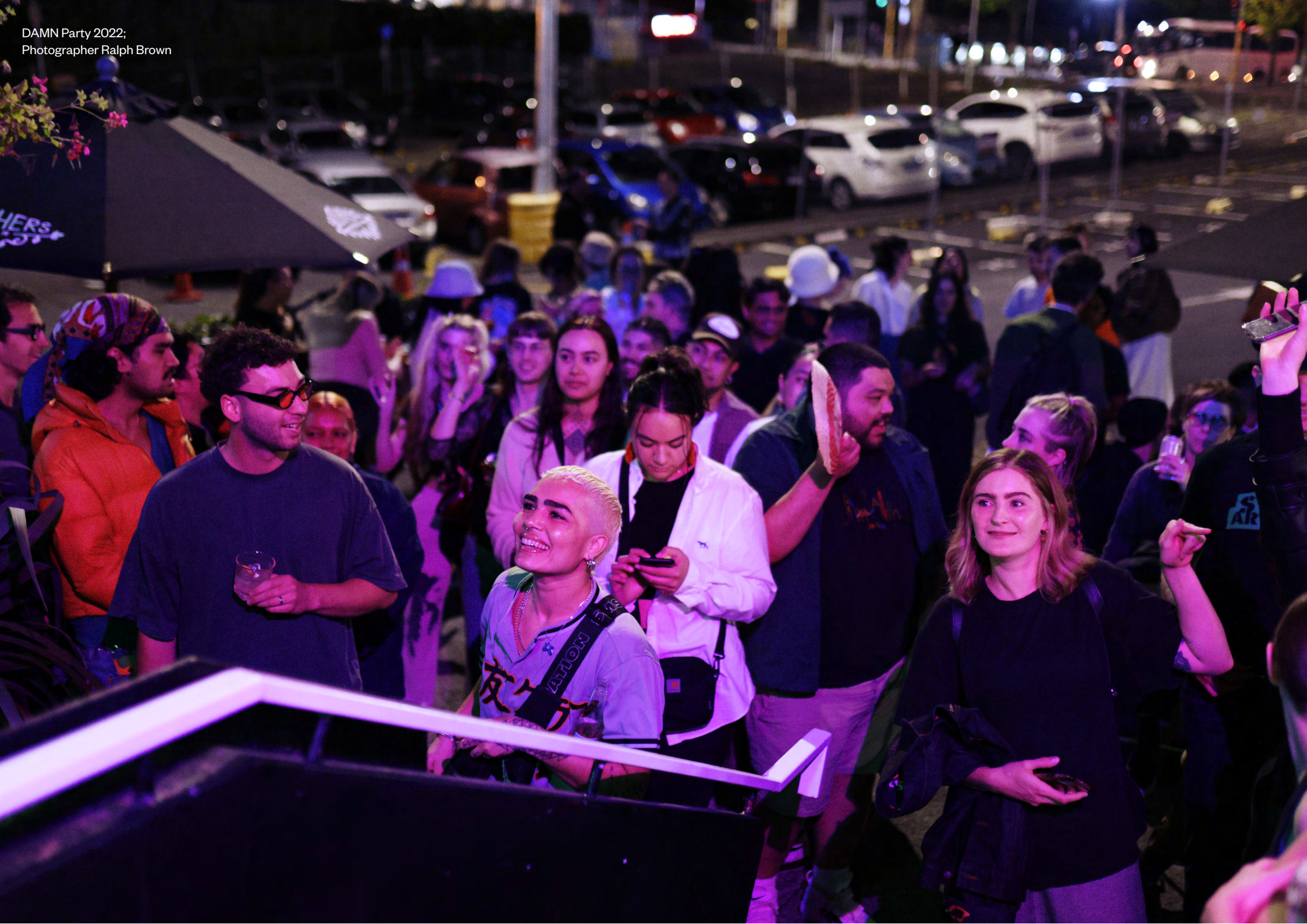
DAMN Party 2022; Photographer Ralph Brown