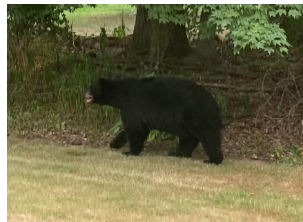
Black bear found roaming near Leslie Weible's CT home