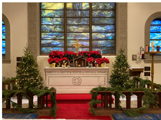
Chancel on Christmas Eve