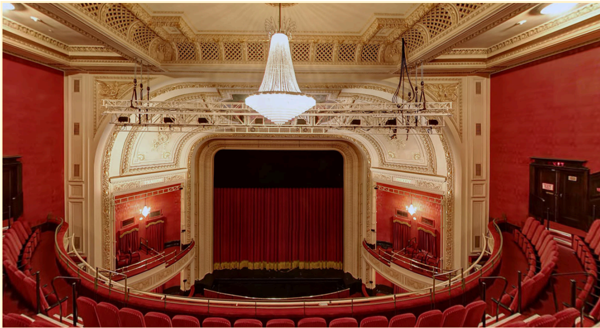
Figure 7: Photograph of view from balcony centre