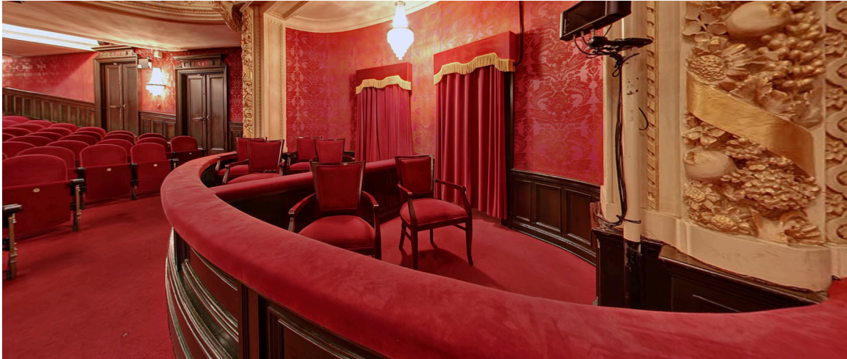
Figure 5: Photograph of Box A & Box D seating sections