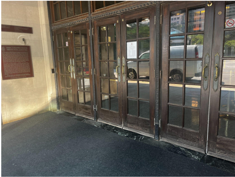
Figure 2: Photograph of the entrance and door at Royal Alexandra Theatre. There are three sets of double doors.