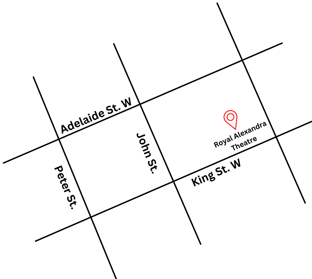
Figure 1: A Map of downtown Toronto with Royal Alexandra at King St. W. and John St., and Adelaide St. W. to the north.