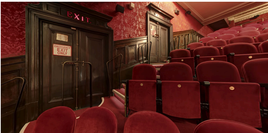
Figure 6: Photograph of Dress Circle stairs, handrails, and seating.