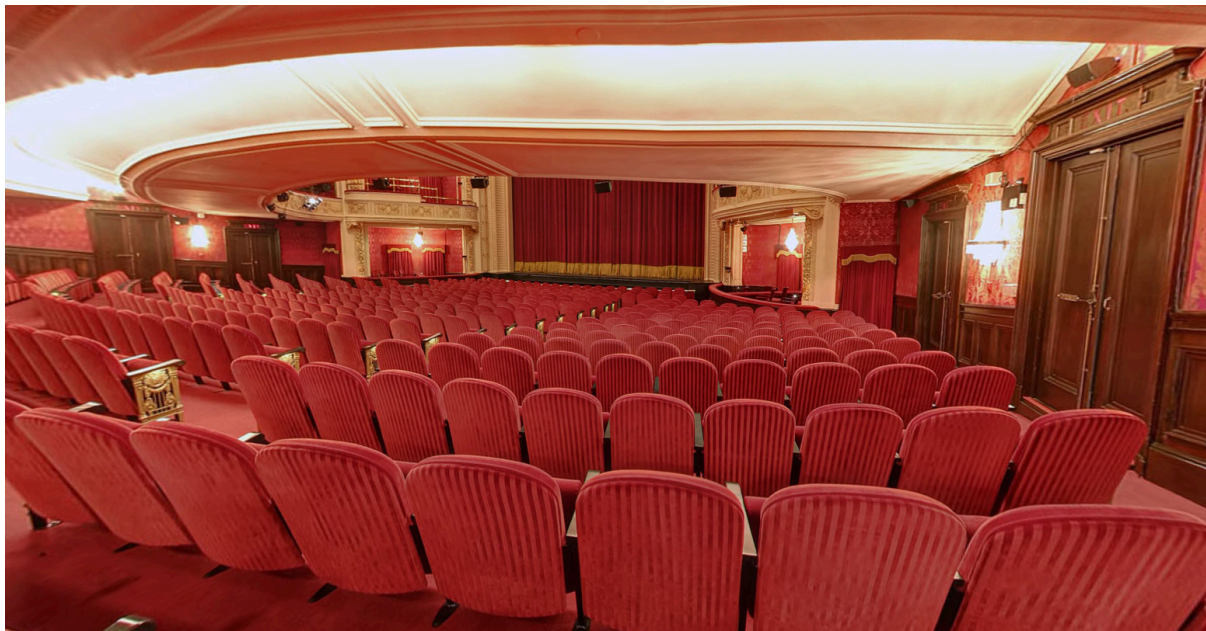
Figure 4: Photograph of approximate view from Orchestra House Right.

There are a total of 9 wheelchair accessible seats, including: