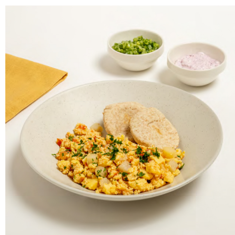
Scrambled Eggs with Potatoes