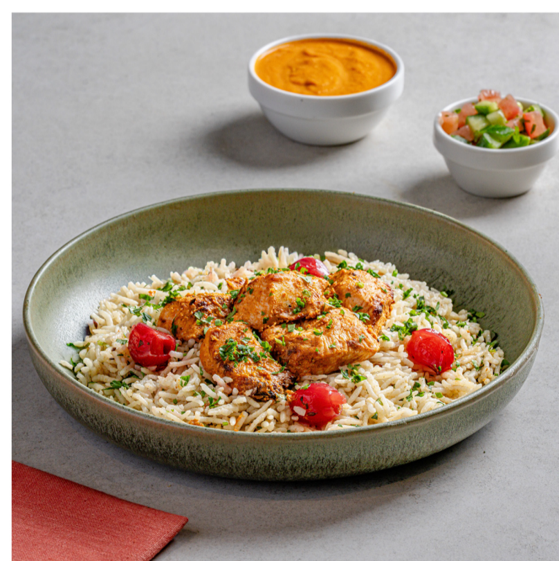
Guilt Free Butter Chicken