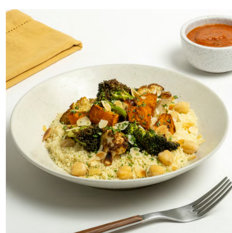
Moroccan Vegetable Couscous