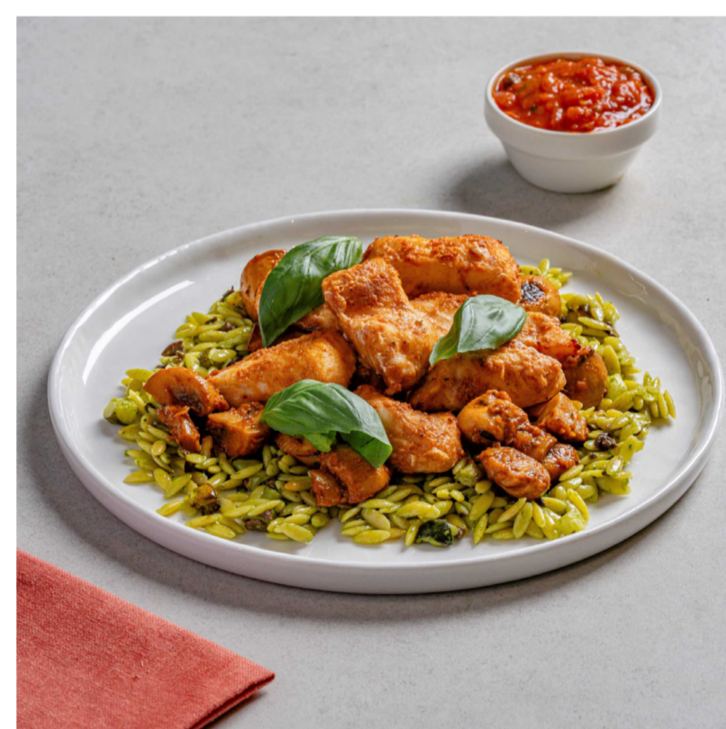
Fish with Basil Orzo