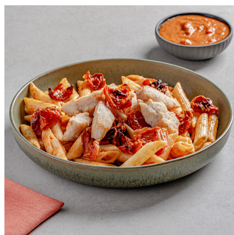
Lemon Marinated Fish with Penne Pasta