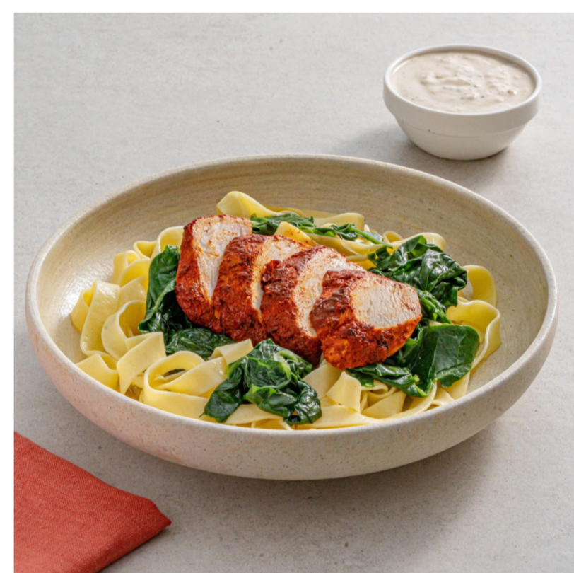
Grilled Mexican Chicken with Fettuchini Pasta