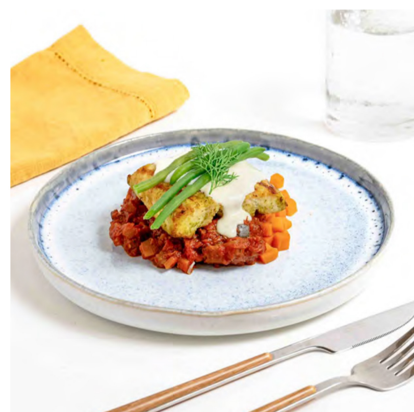
Fish Fillet with Ratatouille