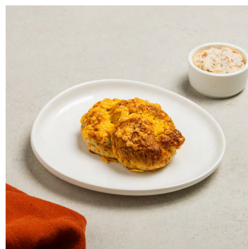
Cheddar Oregano Twist