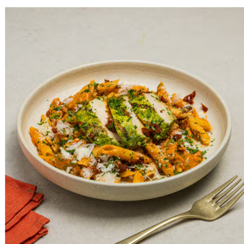
Grilled Chicken with Pink Pasta