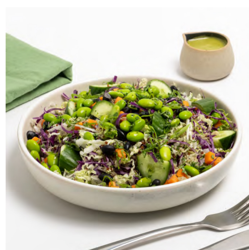
Chinatown Quinoa Salad