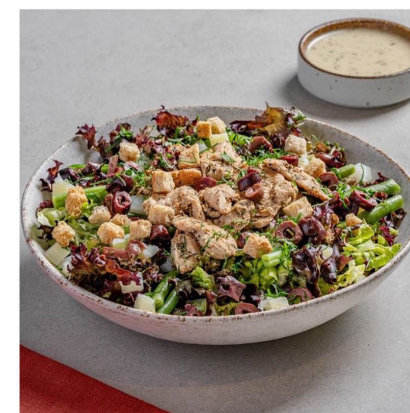
Chicken Nicoise Salad