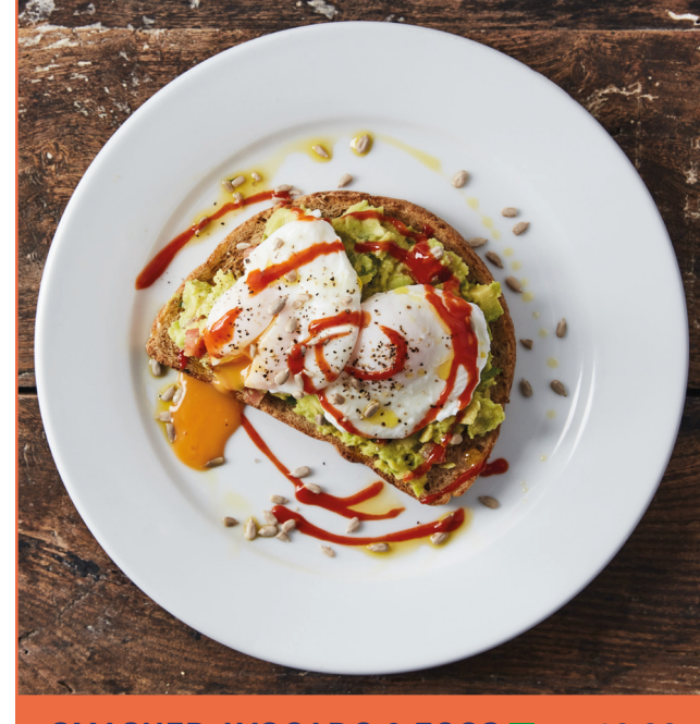
SMASHED AVOCADO & EGGS ▼ 10.99 Homemade smashed avocado served on toast, topped with two free range poached eggs and drizzled with sriracha

Lorne sausage, back bacon, free range fried egg, tattie scone, roasted tomato and baked beans