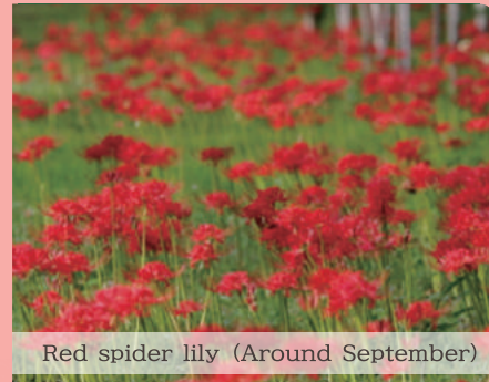
Red spider lily (Around September)