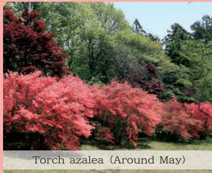
Torch azalea (Around May)

Besides someiyoshino, the major variety, other varieties of cherry blossoms are also planted. The period of blooming is slightly different in each variety and it enables you to enjoy cherry blossom viewing for a month.