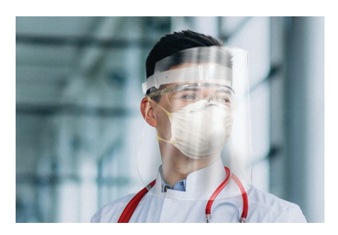
Plastic Face Shields

Critical safety products and communication materials to protect employees and visitors against COVID-19