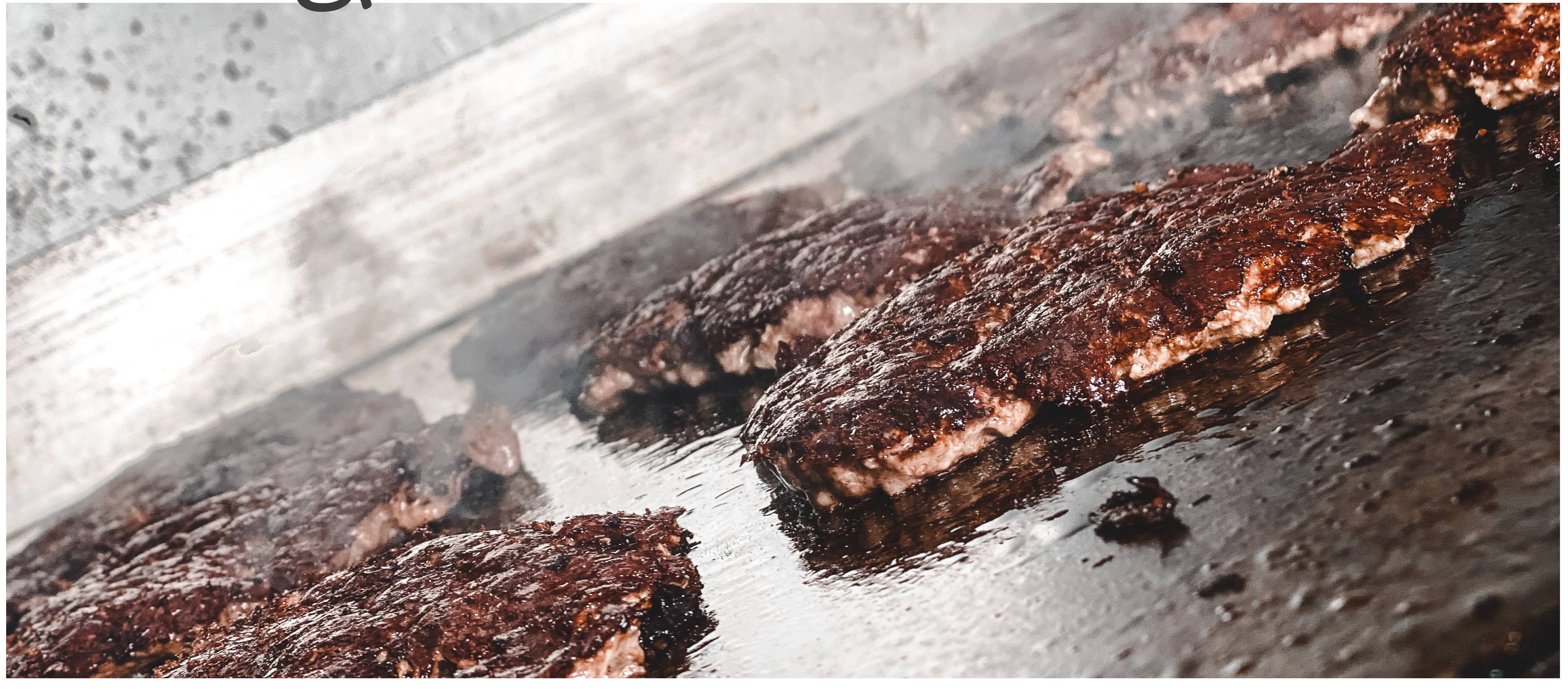
HEAVILY SEASONED. FLIPPED ONCE.