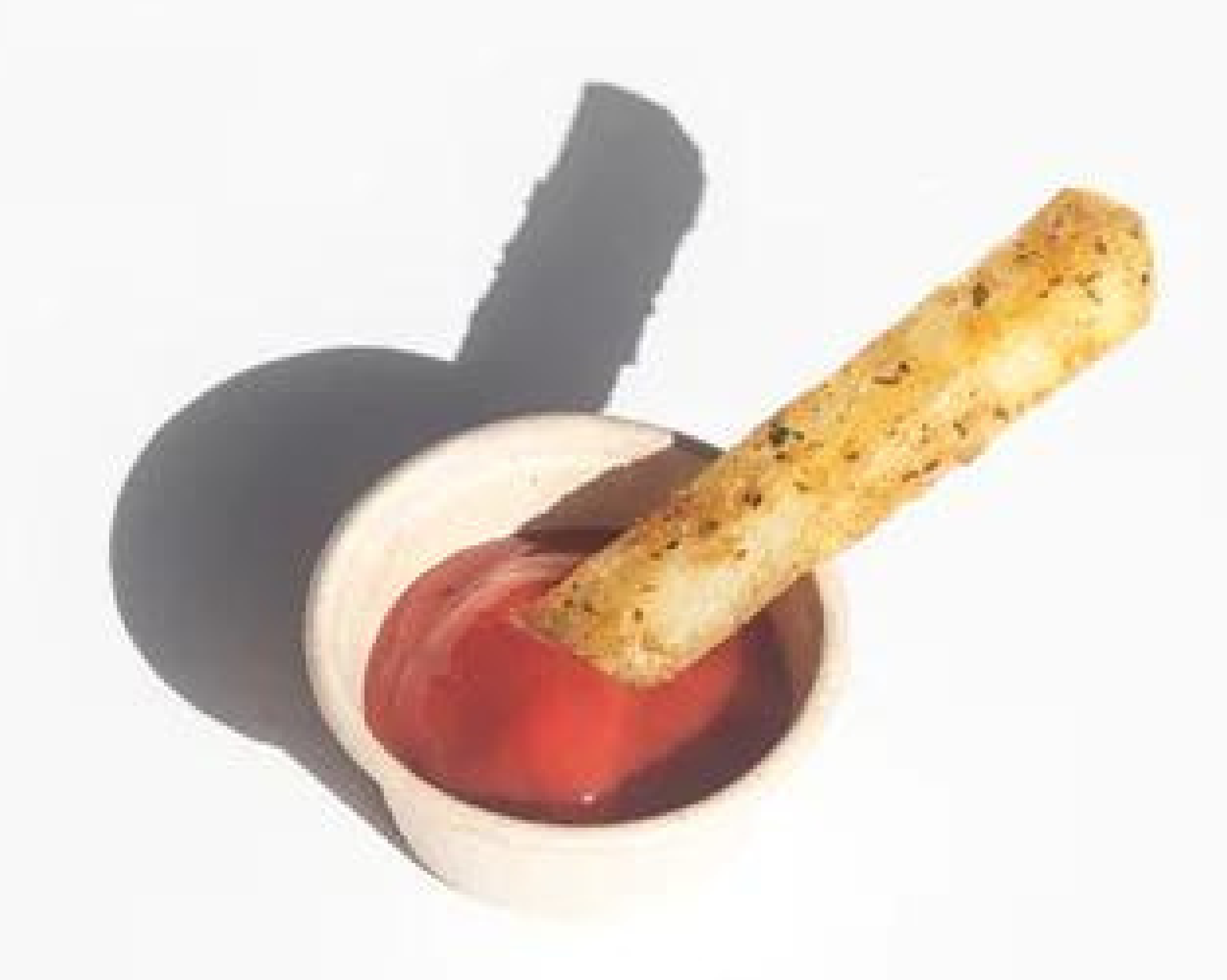
LOOKS GOOD RIGHT?