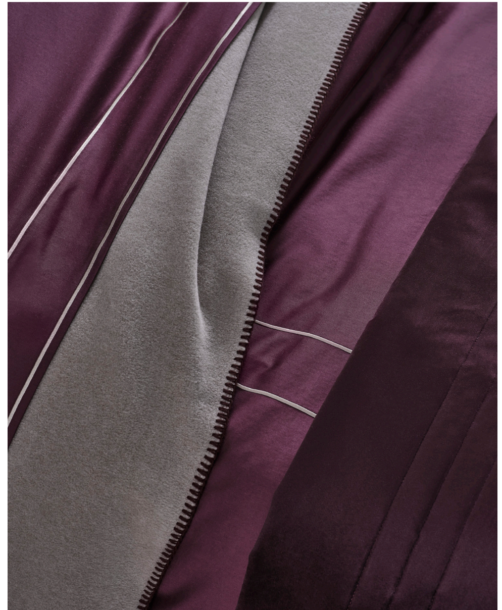
Apulia Sheet Set, Lausanne Quilt & Cushion, Polar Throw