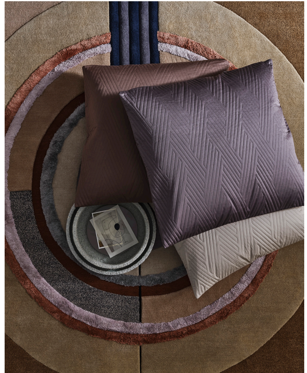
Arrows Cushion, Canestro Cushion