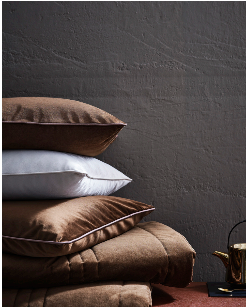
Lausanne Quilt & Cushion