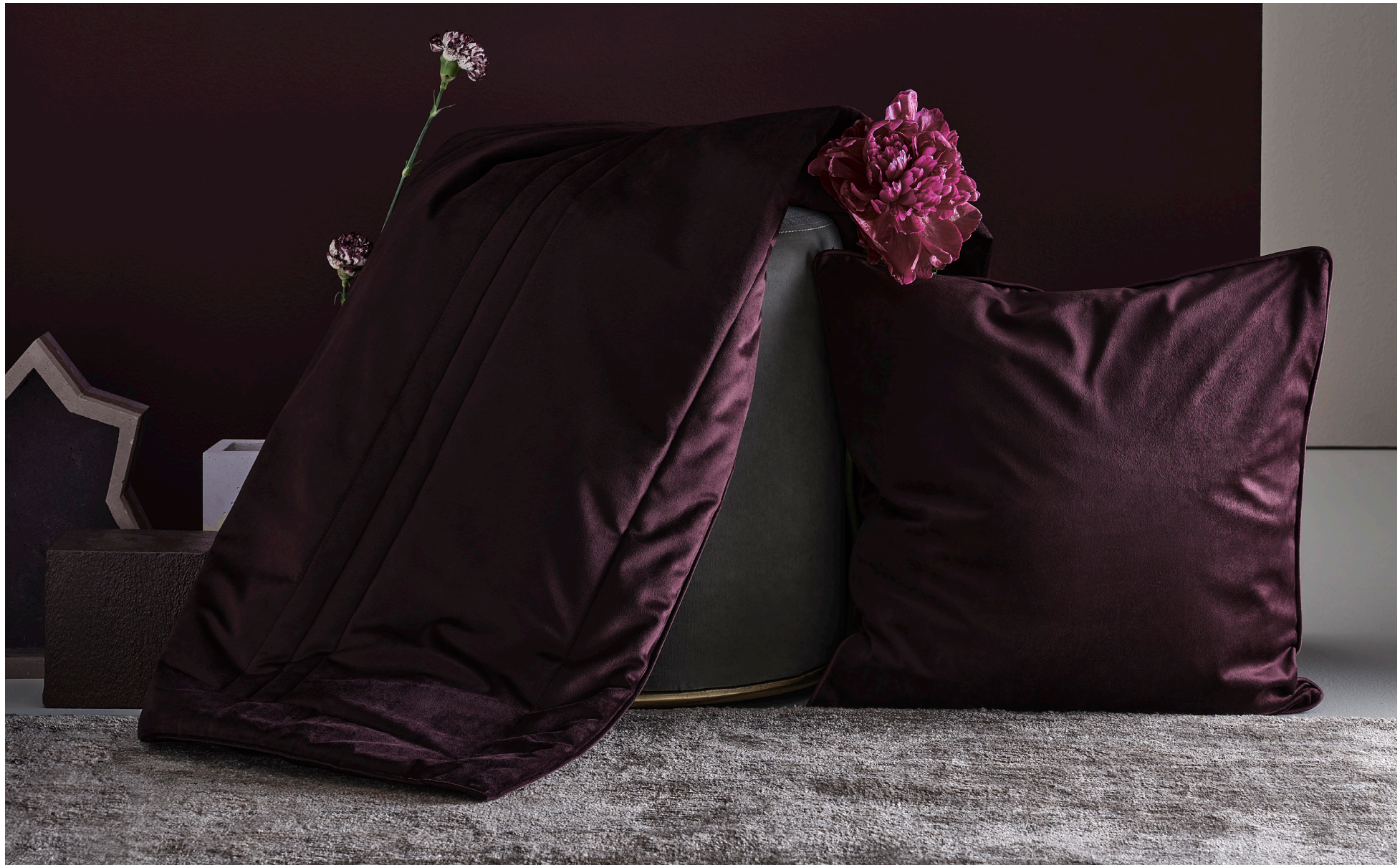
Lausanne Quilt & Cushion