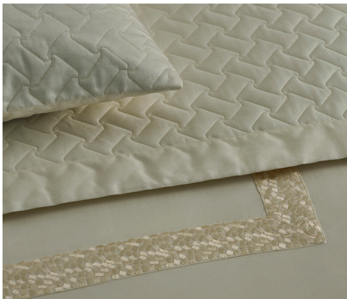
Constallation Sheet Set & Duvet, Agrania Quilt