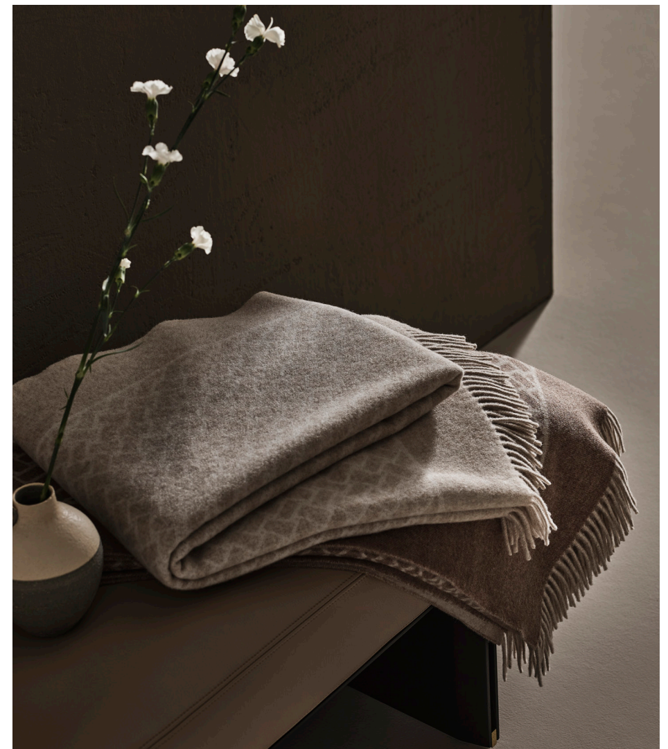
Monza Sheet Set, Lausanne Quilt & Cushion, Argania Throw