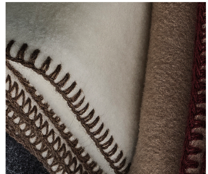
Ray Cushion, Polar Throw, Sateen Frame Sheet Set