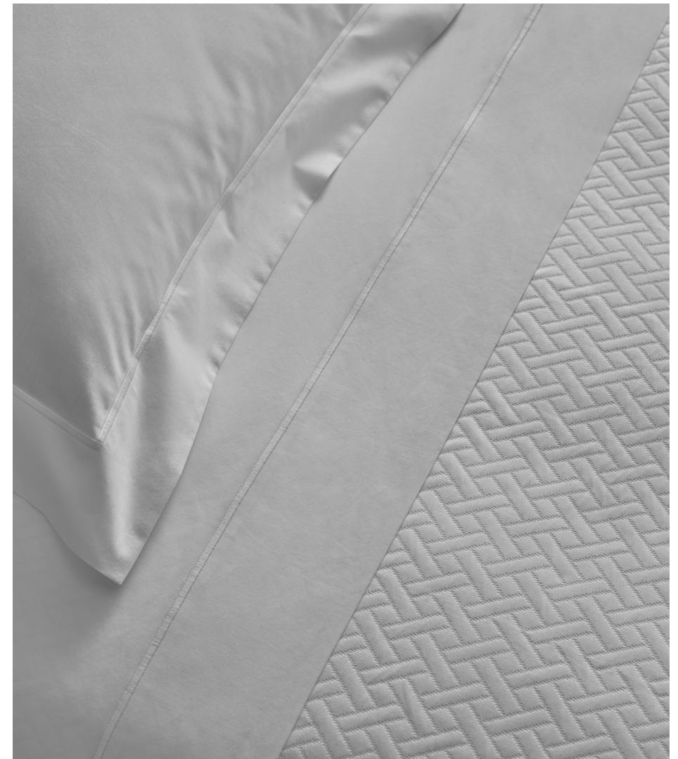
Savona Quilt, One Bourdon Sheet Set