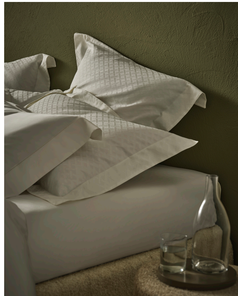
Savona Sham, Monza Sham, Azalea Throw