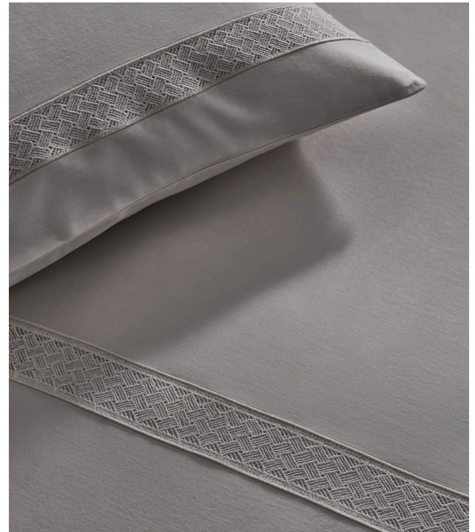
Chess Lace Sheet Set, Melange Throw & Cushion