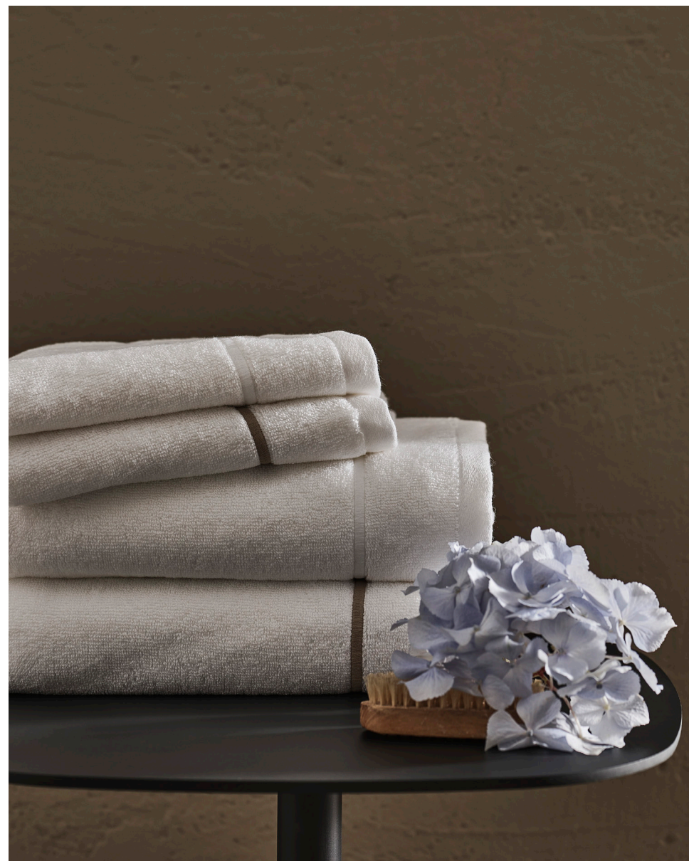
Monza Bath, One Bourdon Bath