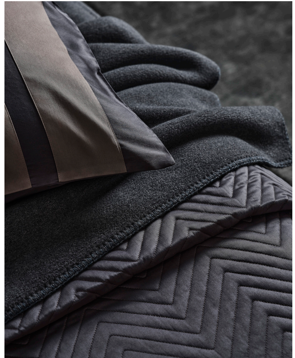
Arrows Quilt & Cushion, Sateen Bands Sheet Set, Polar Throw