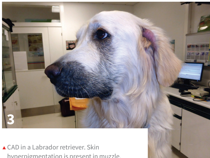
▲ CAD in a Labrador retriever. Skin hyperpigmentation is present in muzzle, periocular, and facial areas; erythema and lichenification in the pinna are seen.