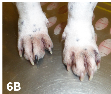
▲ Different aspects of salivary staining in CAD.

deep skin scrapings of dogs with signs similar to those seen with CAD.