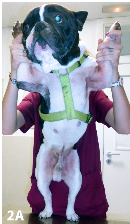
▲ An acute case of erythema and pruritus located in axillae, interdigital, and inguinal regions.