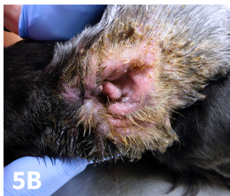
▲ Otitis externa in 2 dogs with CAD. Clinical aspects in an acute otitis (A) and in a chronic case (B).