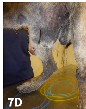
▲ Chronic generalized CAD in a German shepherd dog, with lichenification and hyperpigmentation.