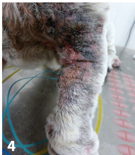
▲ Erythema and lichenification located in ventral thorax and flexural surface of the elbow.