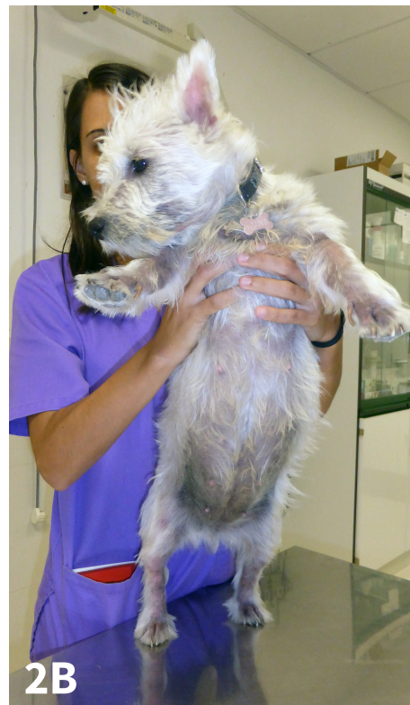
▲ A chronic case of hyperpigmentation and alopecia in the same areas.

plicated with secondary infections (eg, bacterial or yeast overgrowth) or other aggravating factors (eg, food, fleas, contact irritants).