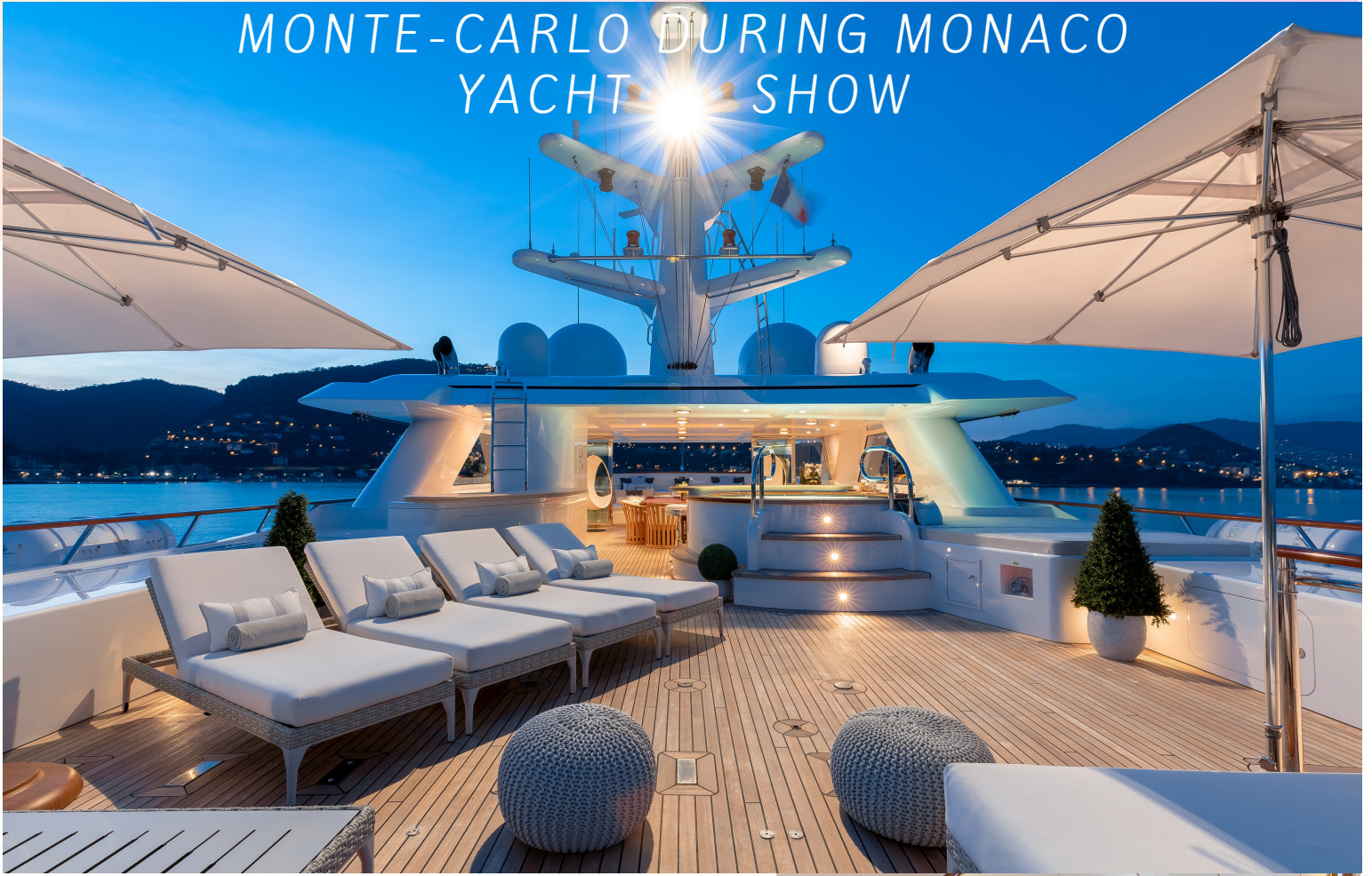
Luna B - KK Superyachts

AMAALA, the ultra-luxury development situated along Saudi Arabia's Red Sea coast, which is focused on integrated wellness and healthy living, signed a partnership agreement on Friday 27th September with The Prince Albert II of Monaco Foundation, the Centre Scientifique de Monaco and Oceanographic Institute. The VIP Signing Ceremony took place at the Oceanographic Institute on the final evening of the Monaco Yacht Show and was attended by HSH Prince Albert II of Monaco and even AMAALA Chief Executive.