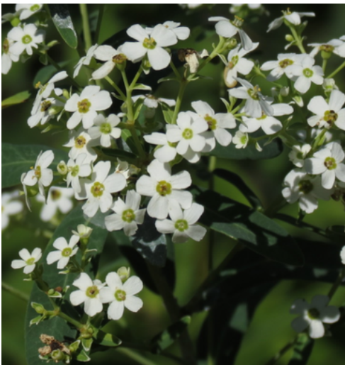
Flowering Spurge ( Euphorbia corollata )