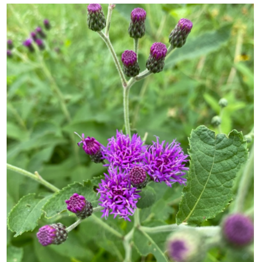
Missouri Ironweed ( Vernonia missurica )