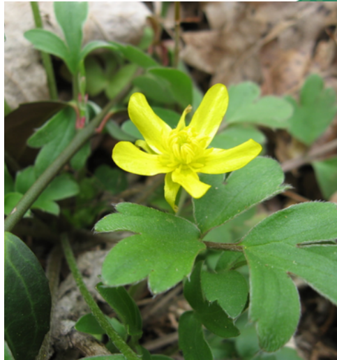
Early Buttercup ( Ranunculus fascicularis )