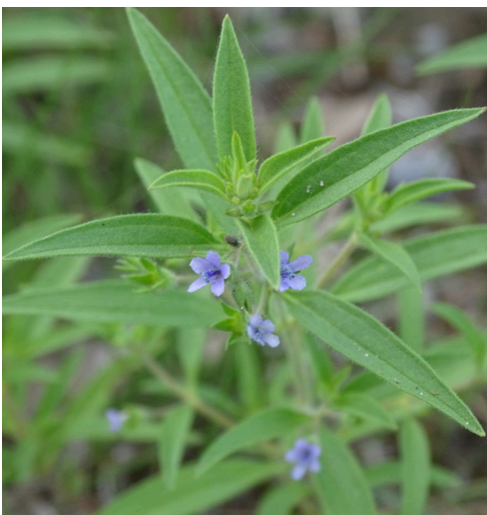
Fluxweed ( Trichostema brachiatum )