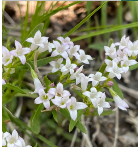
Canada Bluets ( Houstonia canadensis )