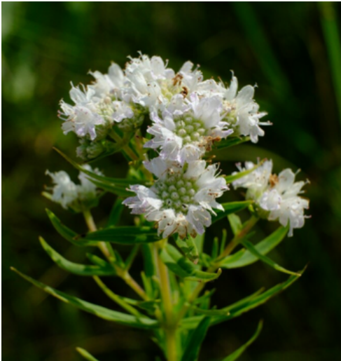
Virginia Mountain-mint ( Pycnanthemum virginianum )