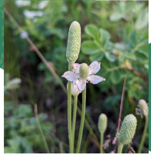
Thimbleweed ( Anemone cylindrica )