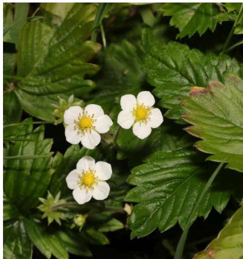
Wild Strawberry ( Fragaria virginiana )