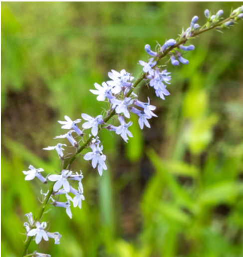
Pale Spiked Lobelia ( Lobelia spicata )