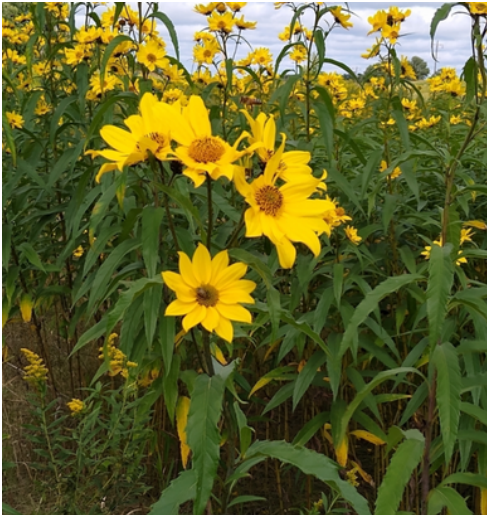
Tall Sunflower ( Helianthus giganteus )