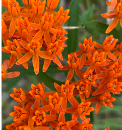
Butterfly Milkweed ( Asclepias tuberosa )