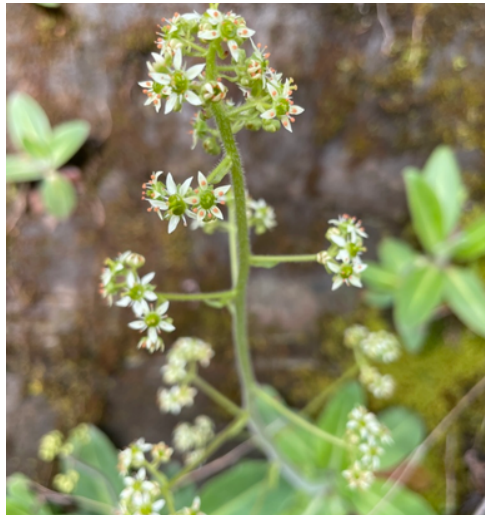
Early Saxifrage ( Micranthes virginiensis )