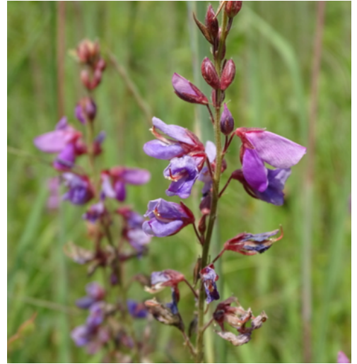
Showy Tick-trefoil ( Desmodium canadense )