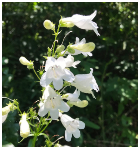
Foxglove Beardtongue ( Penstemon digitalis )