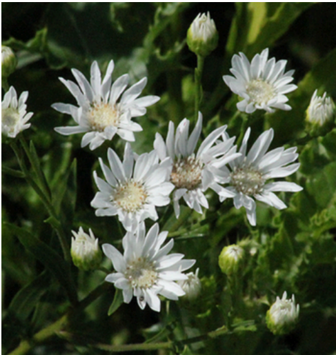
Upland White Goldenrod ( Solidago ptarmicoides )