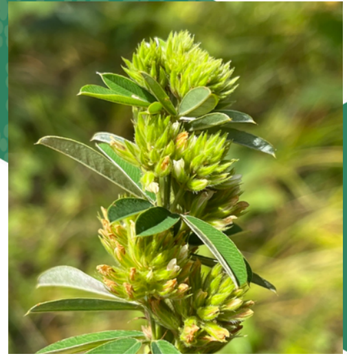
Round-headed Bush Clover ( Lespedeza capitata )