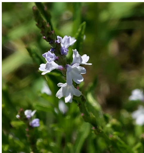
Narrowleaf Vervain ( Verbena simplex )