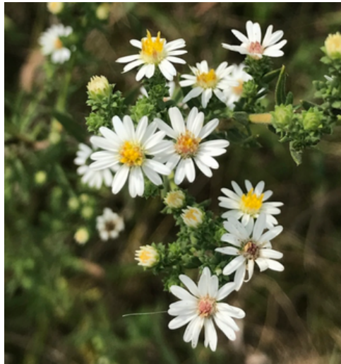
Heath Aster ( Symphyotrichum ericoides )