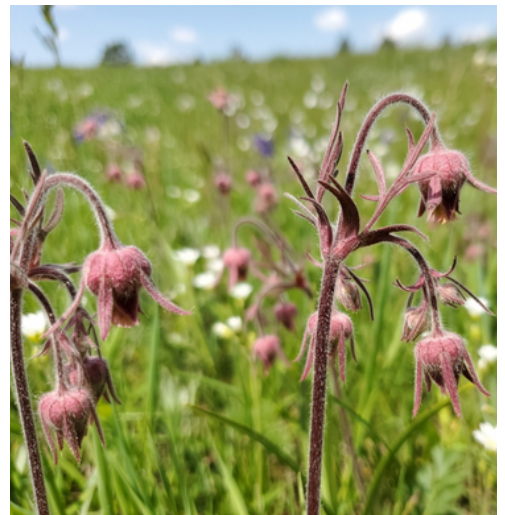
Three-flowered Avens ( Geum triflorum )