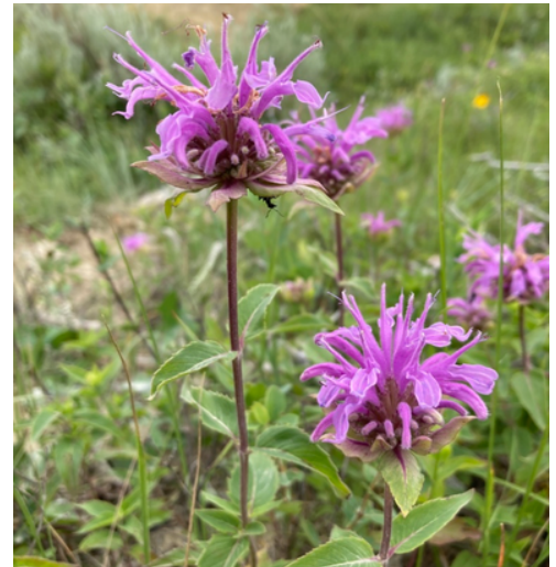
Wild Bergamot ( Monarda fistulosa )