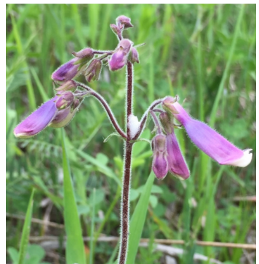
Hairy Beardtongue ( Penstemon hirsutus )