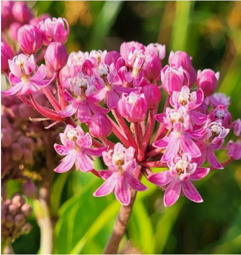
Swamp Milkweed ( Asclepias incarnata )