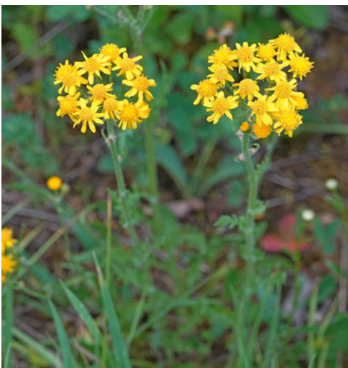
Balsam Groundsel ( Packera paupercula )