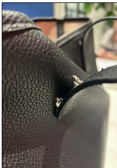
Example for handbag: