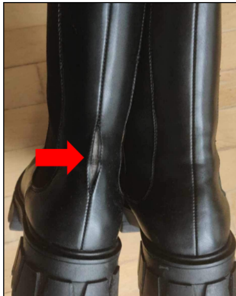
Example for shoes: