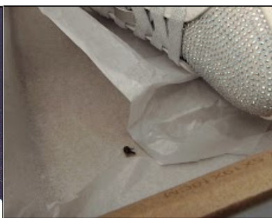
Example for shoes