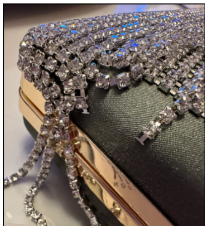
Example for handbag