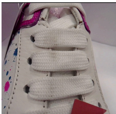
Example for shoes