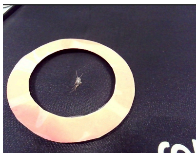
Example for textiles