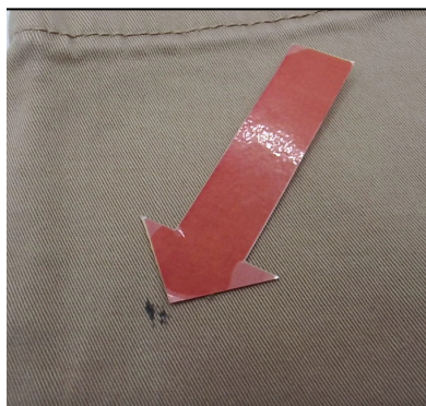
Example for textiles