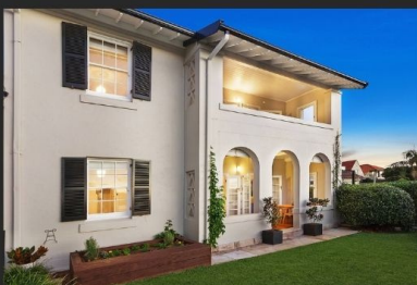
4 Oyama Avenue, Manly