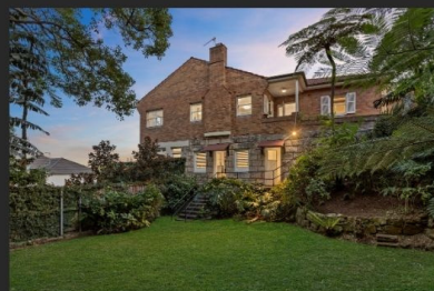
38 West Street, Balgowlah