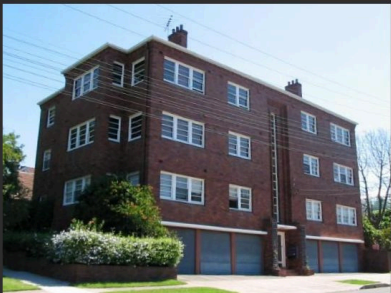
4/20 Reddall Street, Manly Coming Soon Contact Agent