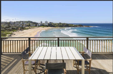
9 Crown Road, Queenscliff SOLD

If you're thinking about selling or would like a property appraisal, call Jake.