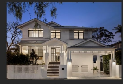
54 Golf Parade, Manly

Contemporary beach house with stunning ocean views Auction 12th August