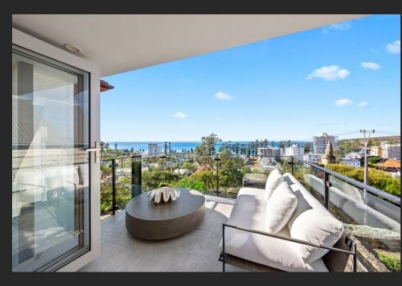
35 Kangaroo Street, Manly