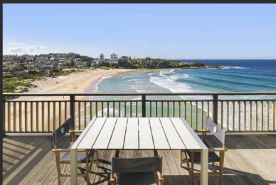
9 Crown Road, Queenscliff SOLD