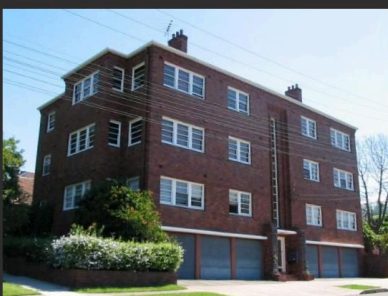
4/20 Reddall Street, Manly Coming Soon Contact Agent