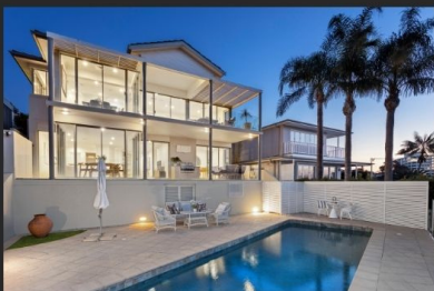
73 Bower Street, Manly