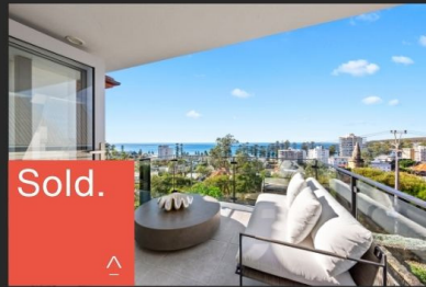
35 Kangaroo Street, Manly