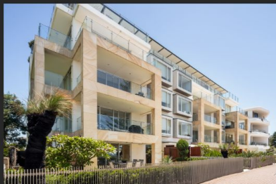
9/133-137 North Styene, Manly