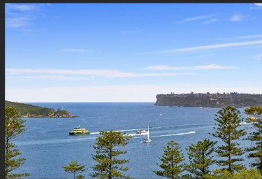
5/17 Laurence Street, Manly