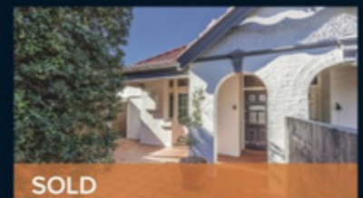
174 Pittwater Road, Manly

Jake Rowe - Principal Sales & Property Management 9977 1111 or 0414 612 546. Shop 1, 22 Darley Road, Manly 2095