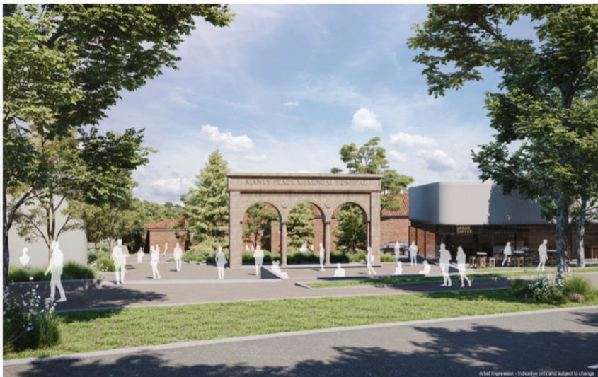
Heritage façade viewed from Darley Road