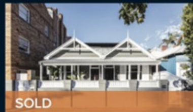
11 Darley Road, Manly

If you are interested in buying or selling we would be delighted to speak with you about your real estate needs.