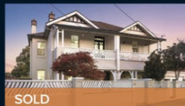
58 Addison Road, Manly