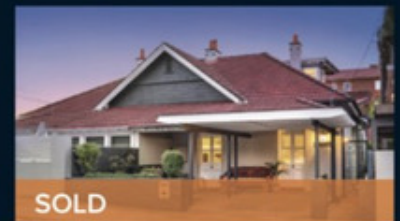
31 Cliff Street, Manly