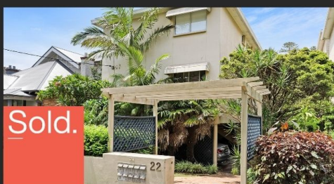
6/22 Malvern Avenue, Manly - $785,000