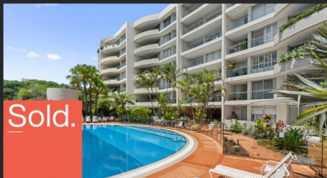
303/45 West Esplanade, Manly - $5,500,000