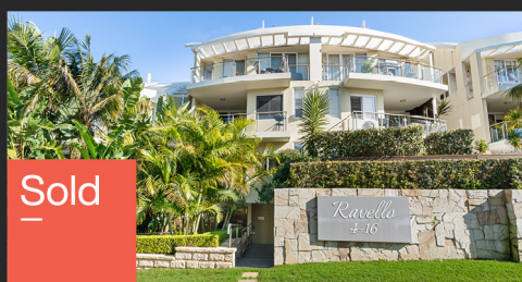
25/4-16 Kingsway Dee Why - $940,000