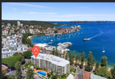
502/54 West Esplanade, Manly