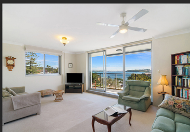
16/36 Osborne Road Manly