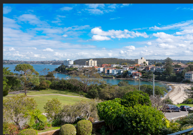
2/75 Stuart Street Manly

Auction Saturday 26th November at 2.00pm