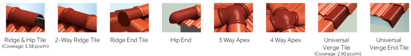
Ridge & Hip Tile (Coverage: 3.38 pcs/m)