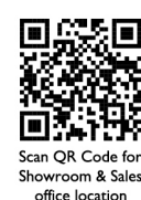
Scan QR Code for Showroom & Sales office location

MONIER MALAYSIA SDN. BHD. (MMSB) reserved the right to change the contents of this document without any prior notice. Printed: 06/2021 © MMSB