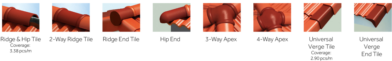
Ridge & Hip Tile Coverage: 3.38 pcs/m