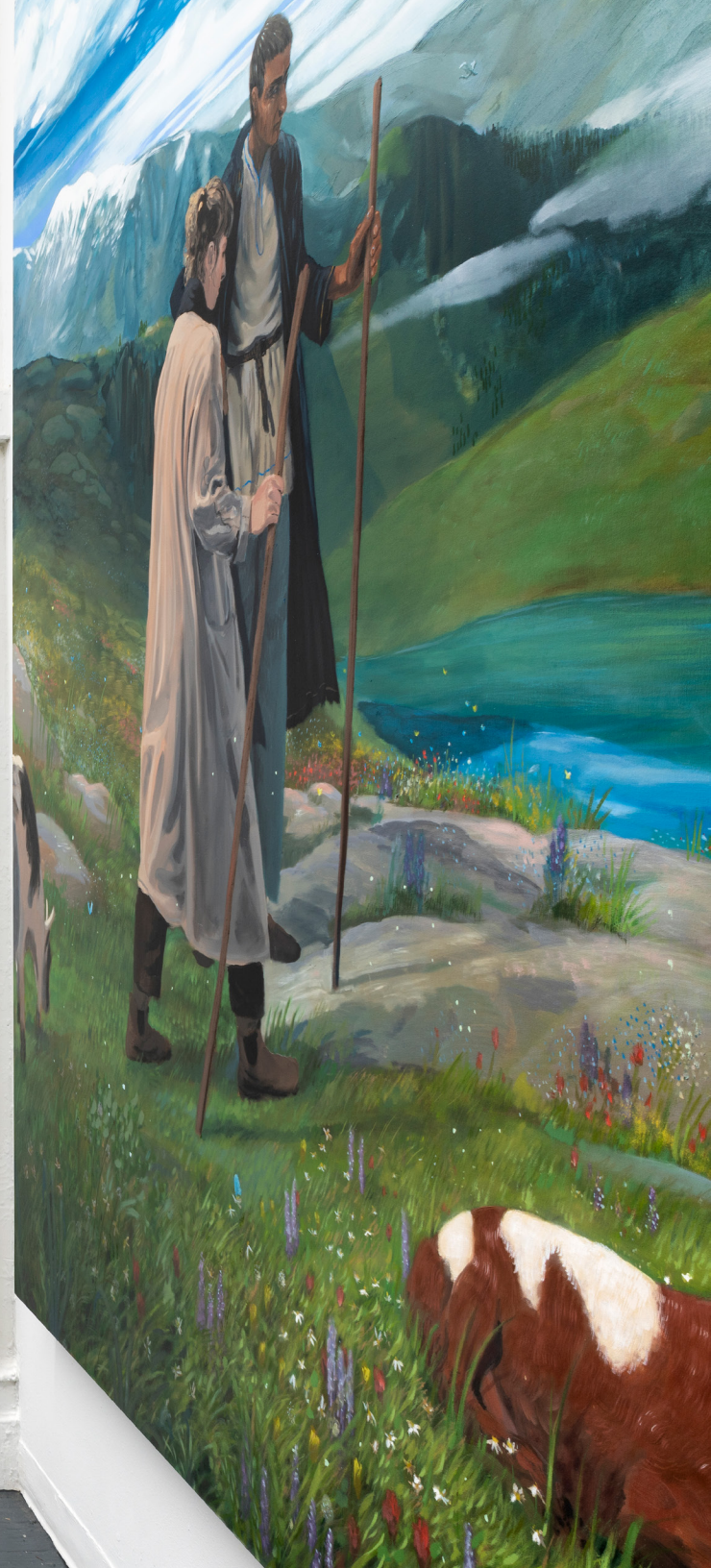
Clark Filio, Heaven Ship [Installation view]