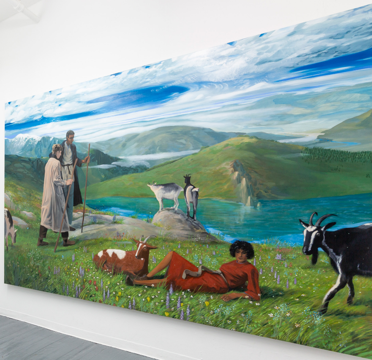
Clark Filio, Heaven Ship [Installation view]