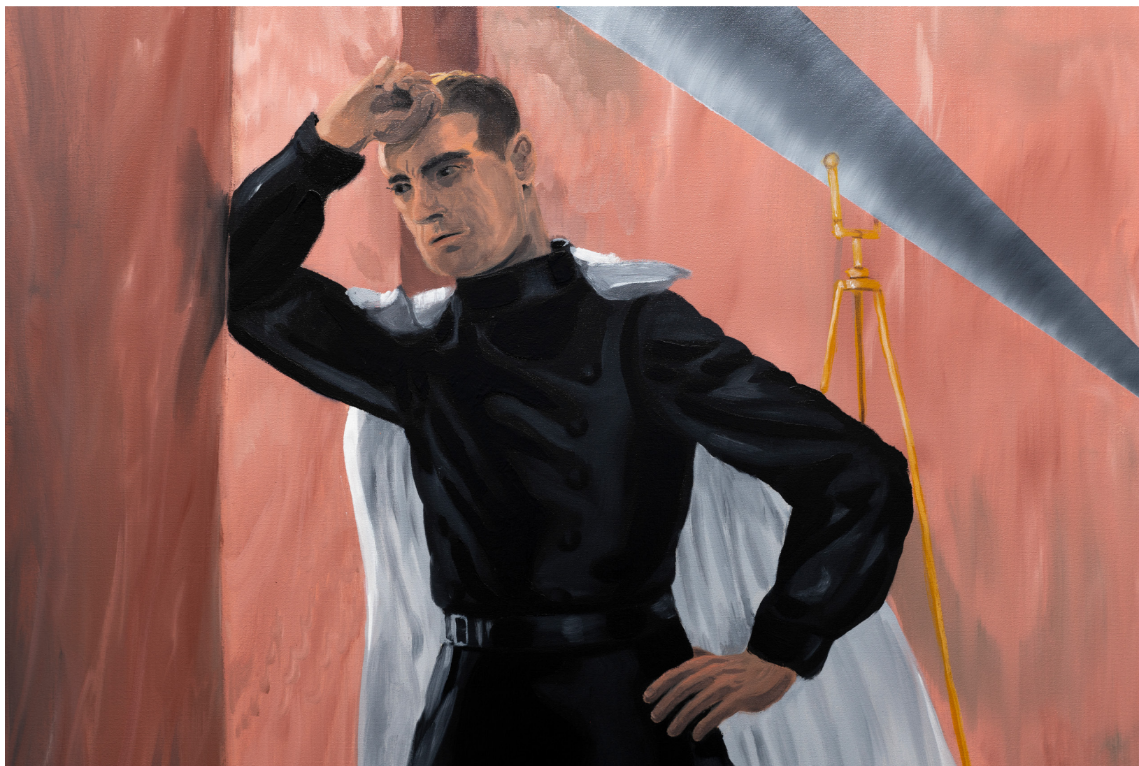
Excelsior , 2020 [detail]