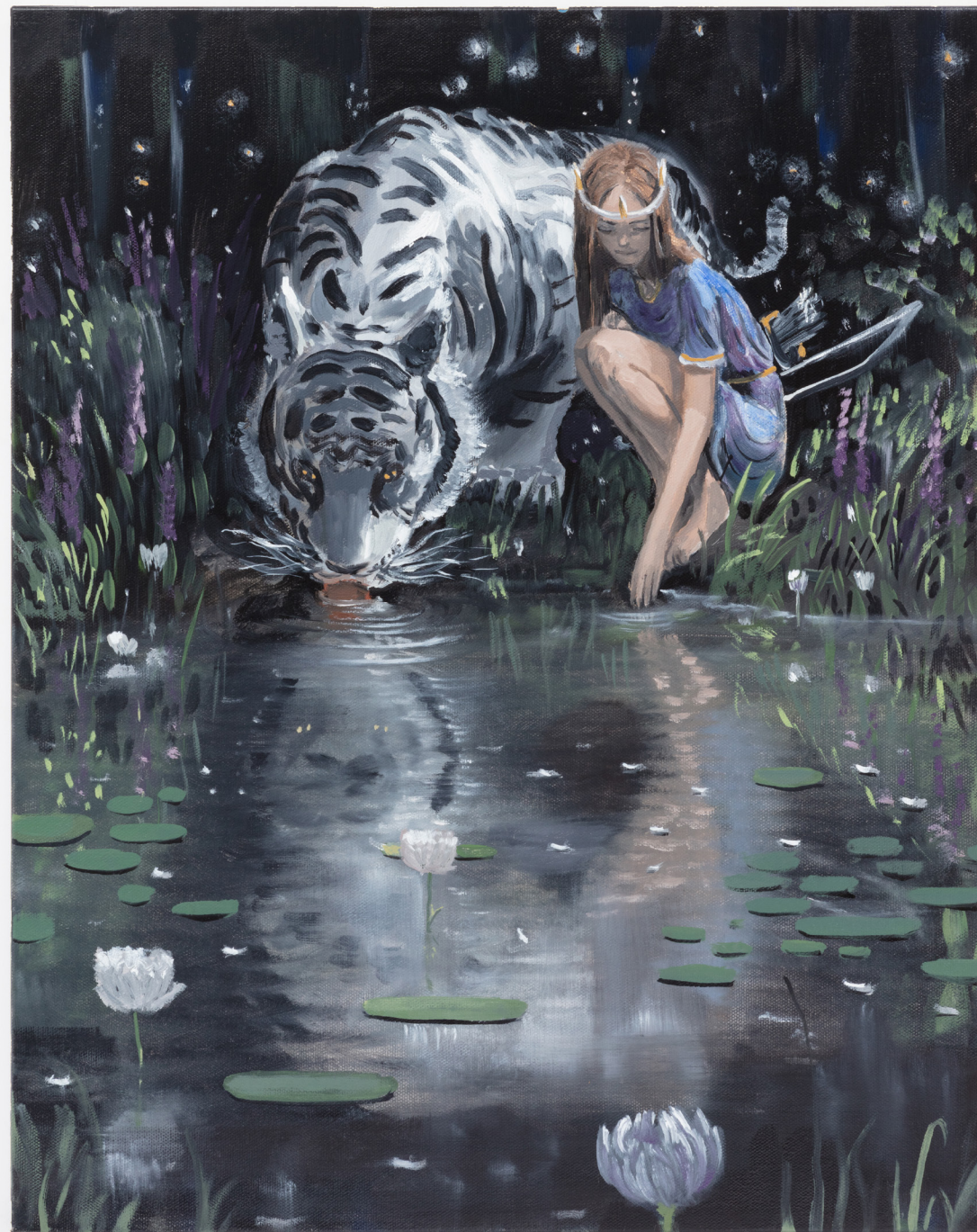
Priestess of the Moon , 2020 Oil on canvas 20 x 16 inches (51 x 41 cm) INQUIRE