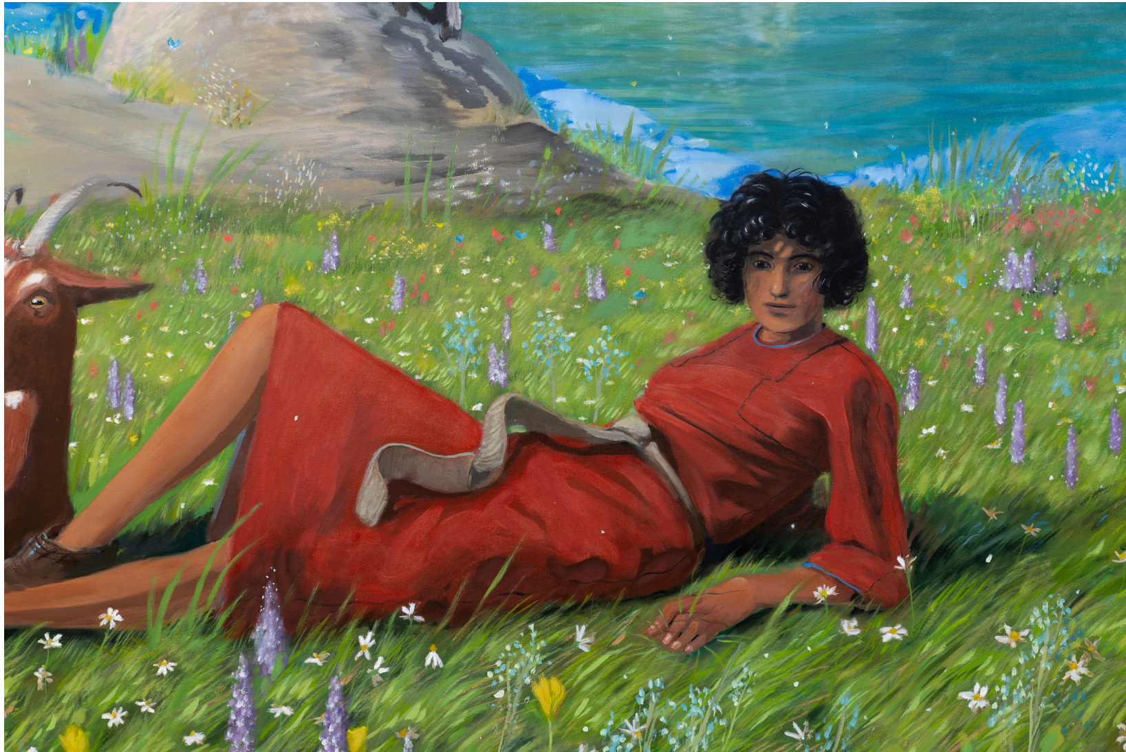
Children of Gont , 2020 [detail]