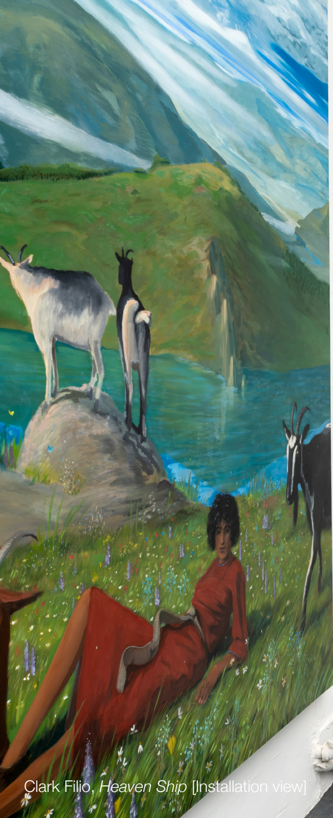
Clark Filio, Heaven Ship [Installation view]