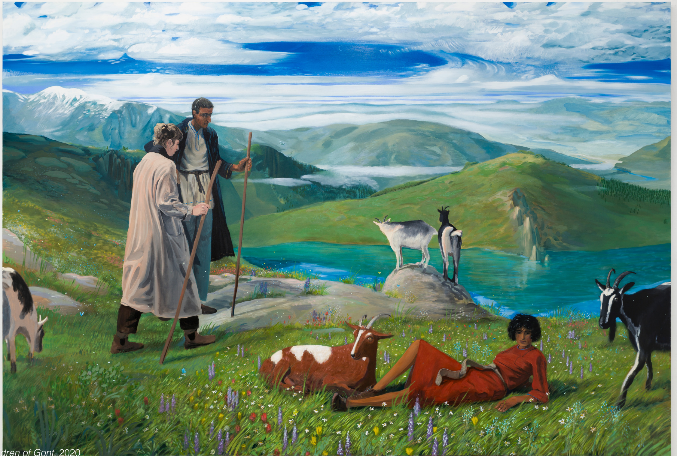
Children of Gont, 2020