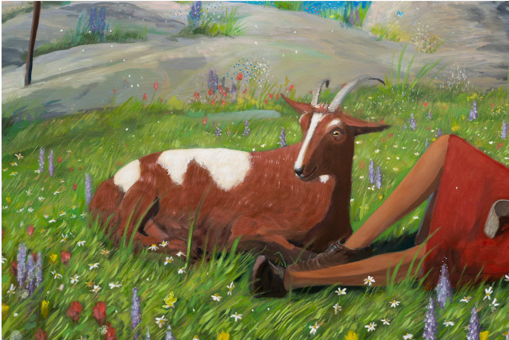
Children of Gont , 2020 [detail]