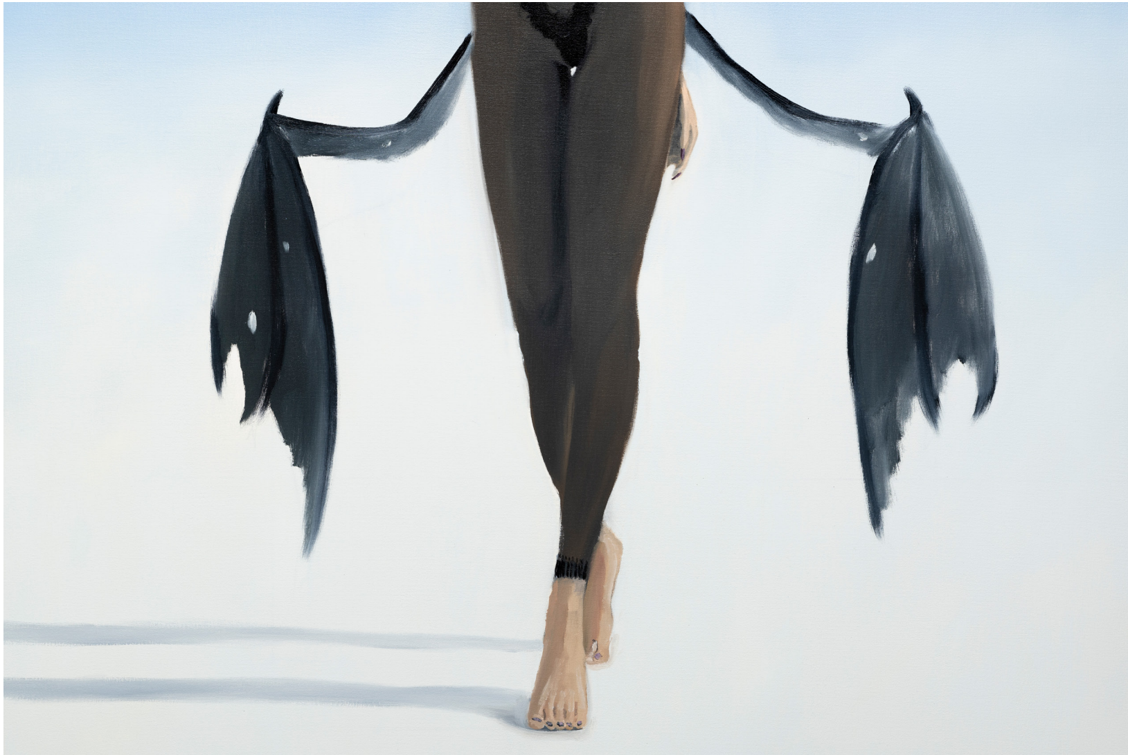
The Baleful Ker, 2020 [detail]