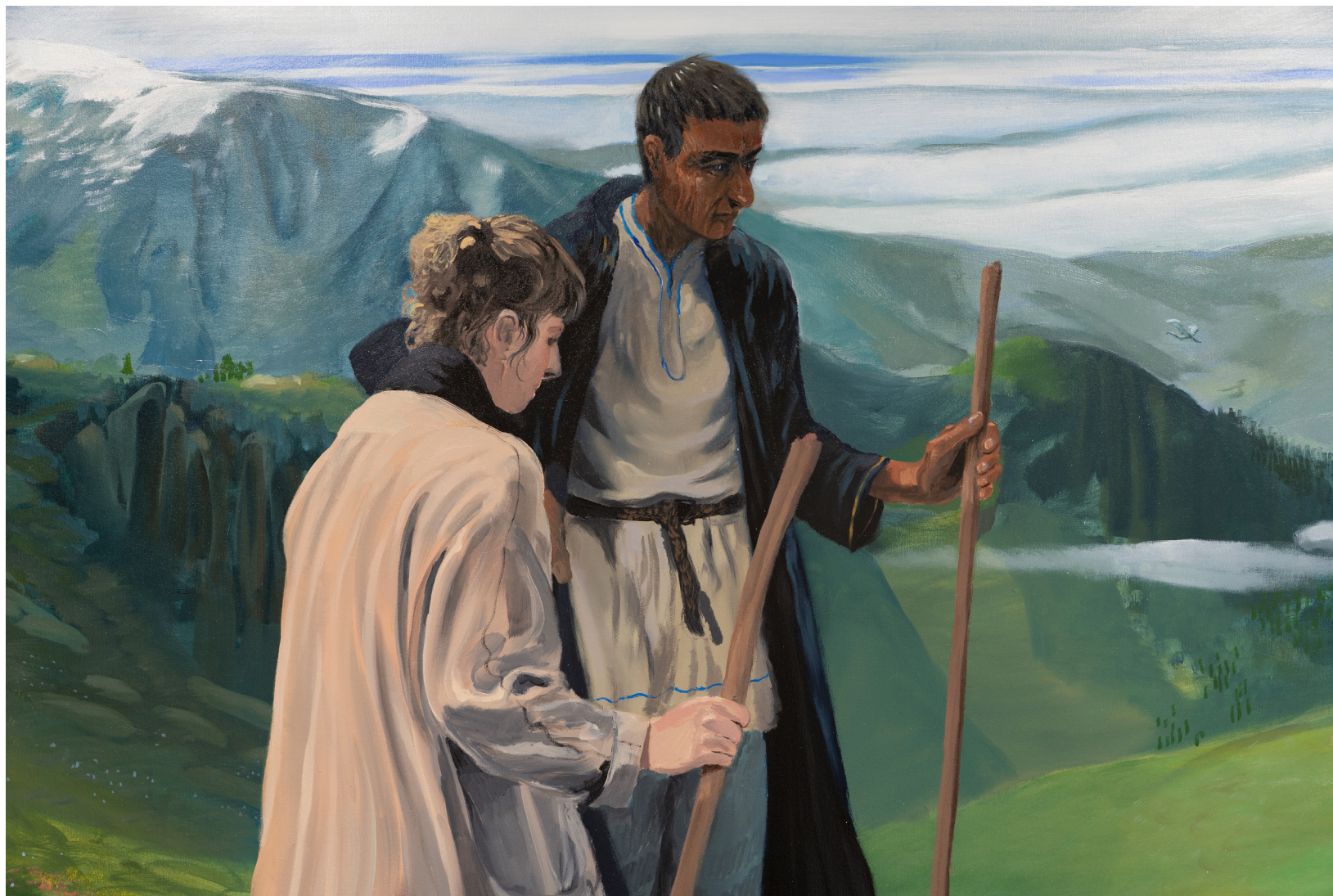
Children of Gont , 2020 [detail]