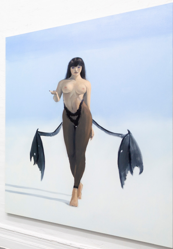
Clark Filio, Heaven Ship [Installation view]