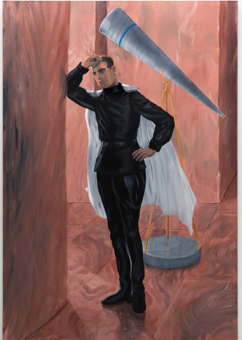
Excelsior , 2020 Oil on canvas 78 x 54 inches (198 x 137 cm) INQUIRE