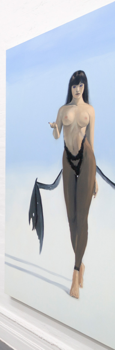
Clark Filio, Heaven Ship [Installation view]