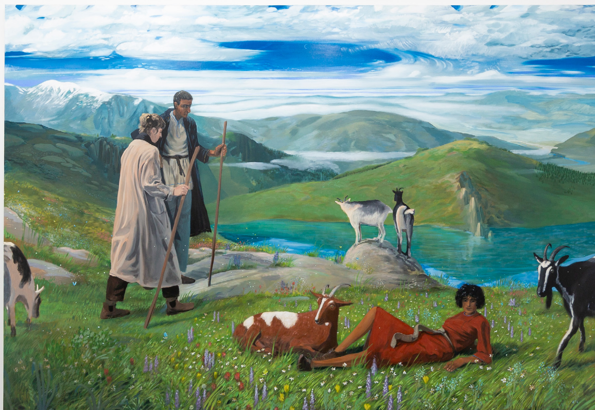
Children of Gont , 2020 Oil on canvas 98 x 144 inches (249 x 366 cm) INQUIRE