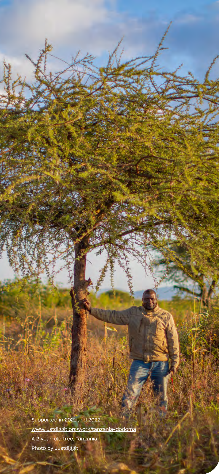
Supported in 2021 and 2022 www.justdiggit.org/work/tanzania-dodoma A 2 year-old tree, Tanzania