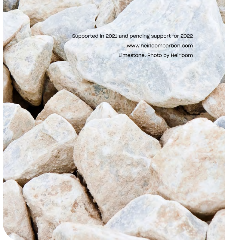
Supported in 2021 and pending support for 2022

Since we made our first pre-purchase of carbon removal from Heirloom, the company has made progress in several aspects. In March 2022, they raised $53 million in equity from Carbon Direct, Ahren