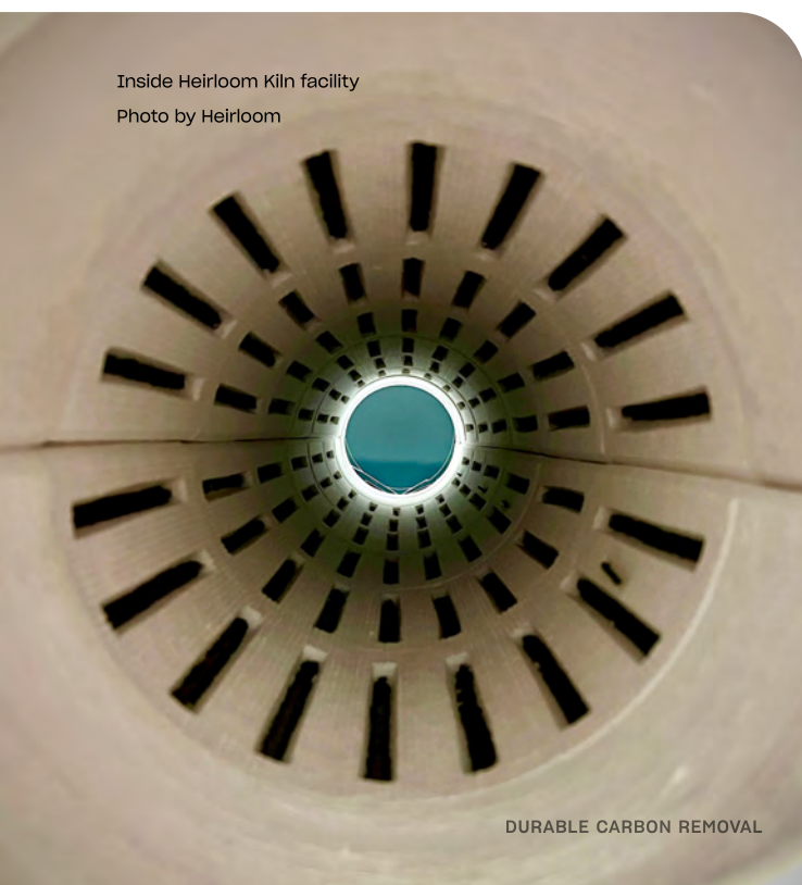
Inside Heirloom Kiln facility

The carbon removal we purchased from Heirloom in 2021 will be delivered by 2024 at the latest from their first direct air capture facility, and the CO 2 will be stored permanently underground.