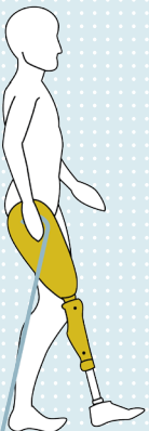
● Walking with walking aids

With the aid of sensors, the Kenevo identifies when you are in a particular everyday situation, such as sitting or standing. It immediately switches to the basic function that supports this movement. These functions are permanently active and can be used intuitively so that you can quickly get used to them. Most of the functions are available in every activity mode. Find out more on the following page.