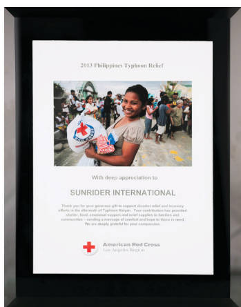
The American Red Cross presented Sunrider International with this Appreciation Plaque for the company's fundraising campaign that raised US$100,000 for Nepal earthquake disaster relief.