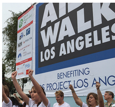
Sunrider was a major sponsor of AIDS Walk Los Angeles for eight consecutive years. This annual event has raised more than $82 million to date to further AIDS awareness.