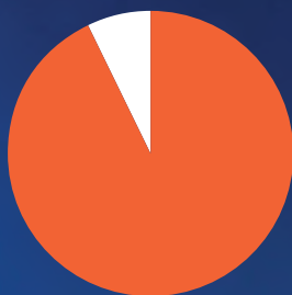
Over 100 Countries