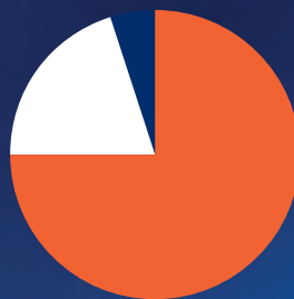
Business Size (by turnover $AUD)