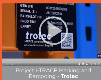
Project i-TRACE Marking and Barcoding - Trotec