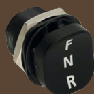
FNR SERIES Robust and reliable