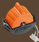
HR SERIES Versatile range