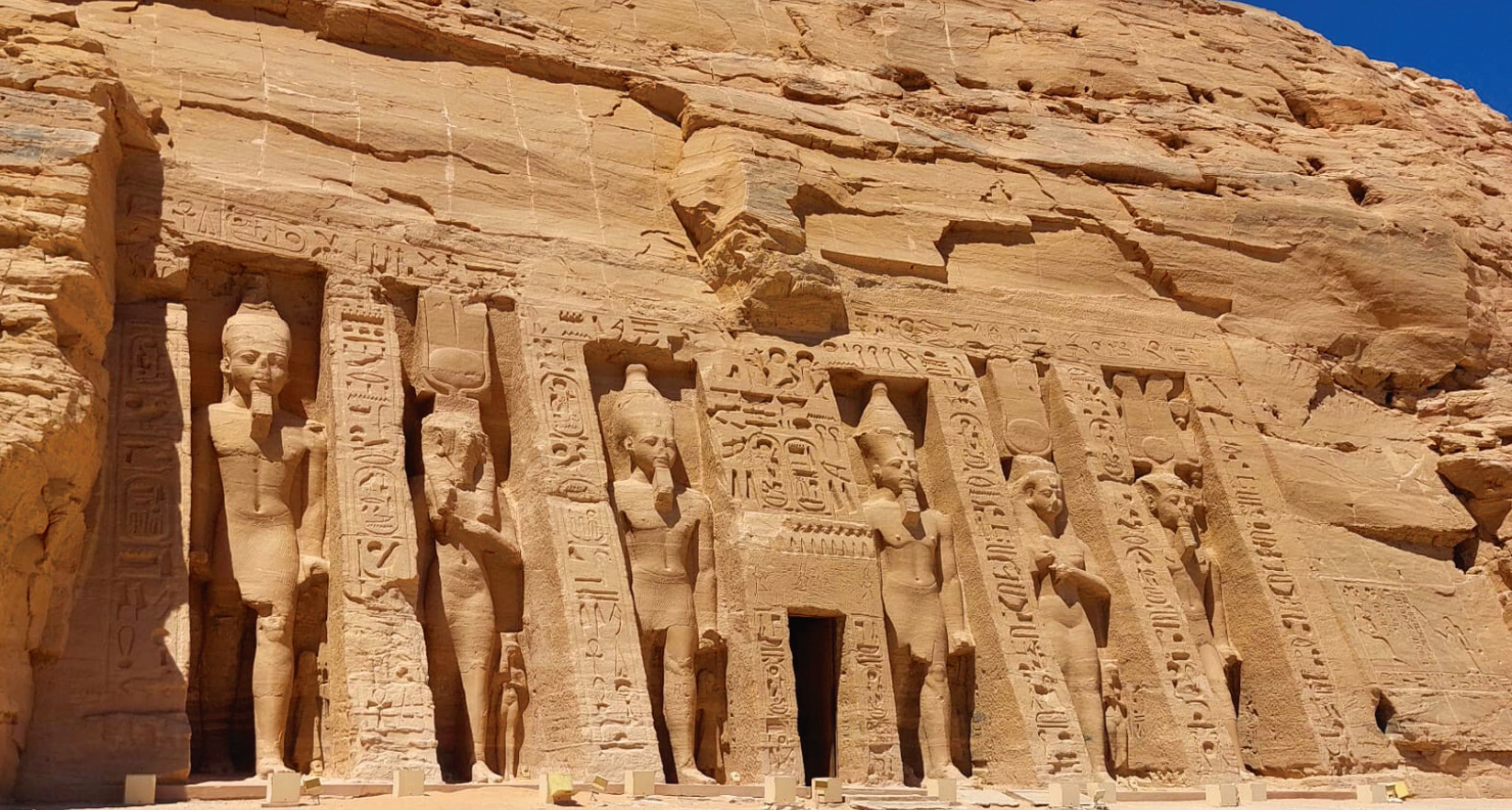
A rock-cut temple at Abu Simbel.