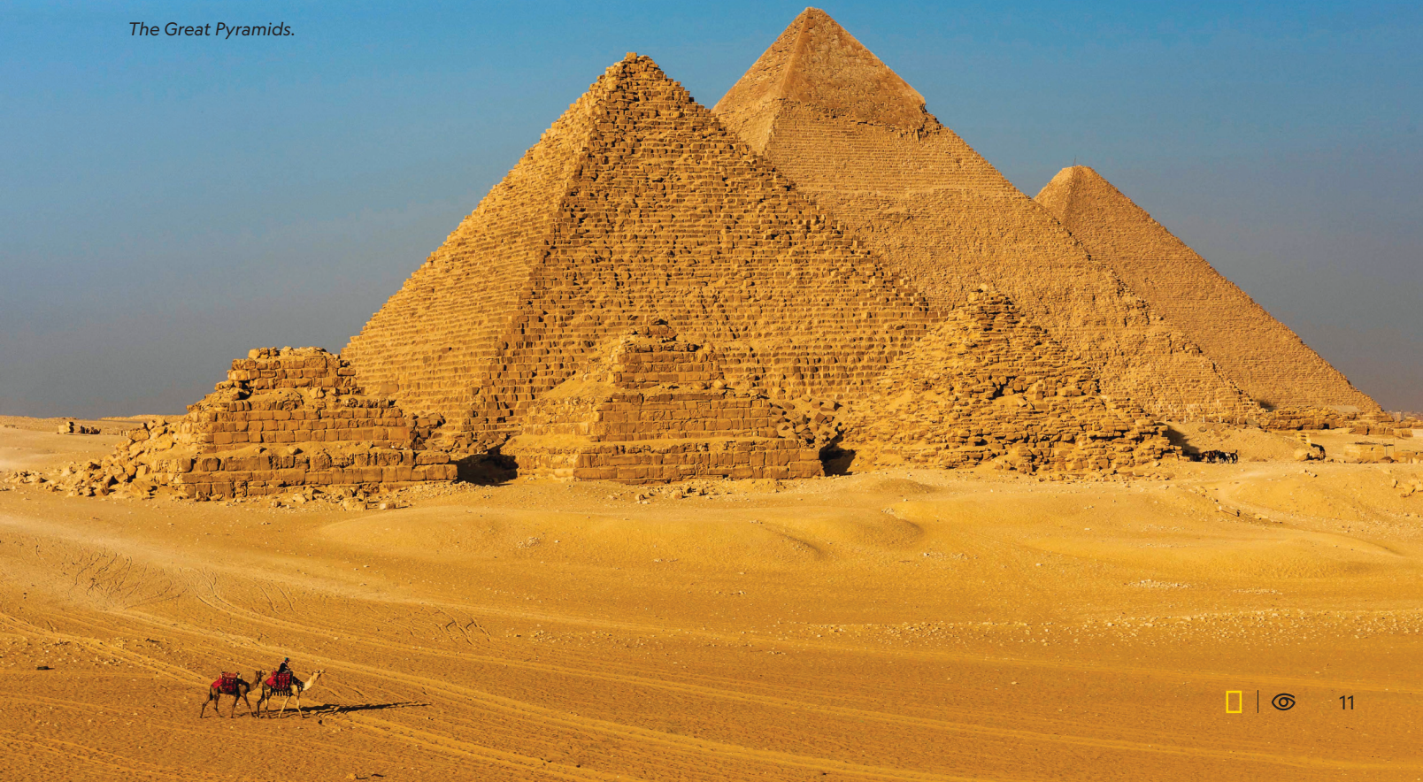
The Great Pyramids.

GRAND EGYPTIAN MUSEUM NOW OPEN: Join Egyptologist guides on a tour of this highly anticipated museum, recently opened to the public. Plus, enjoy an after-hours visit to the Museum of Egyptian Antiquities and special up-close access to the Sphinx.