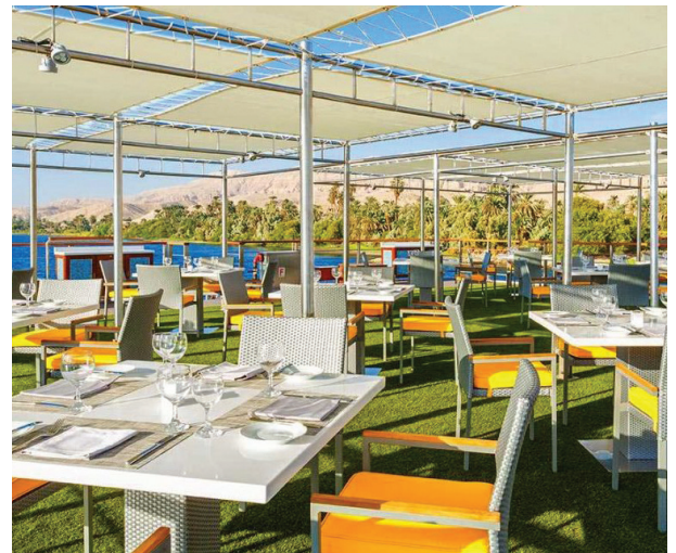
Opposite page: Savor fresh, innovative fare on board; Oberoi Philae. This page: A guest unwinds in the top-deck swimming pool; sun deck dining; guest suite.