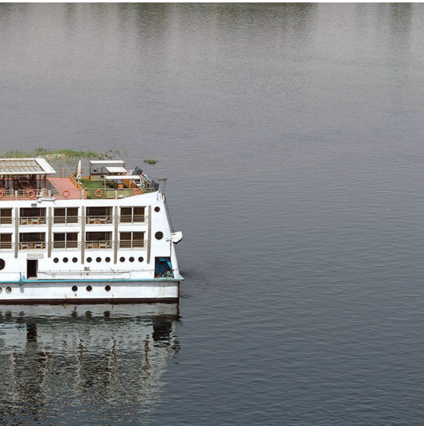
Clockwise from top left: Loungers on the sun deck; ship lobby and bar; St. Region Cairo; private aircraft; Sun Goddess.

For flights in Egypt, travel is by private charter aircraft reserved exclusively for our group. This allows for optimal flight times and a relaxed pace at iconic sites like Abu Simbel—free from the constraints of commercial airline schedules.