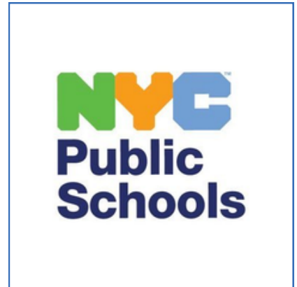
Nana Keita , Older Newcomer Student