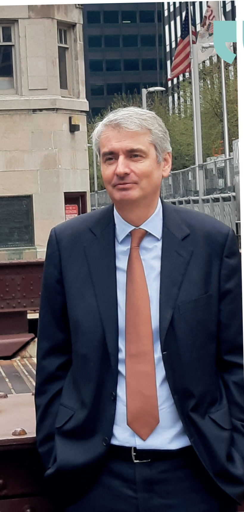
Emmanuel Besnier, CEO of the Lactalis Group

MARKING OUR 89 TH ANNIVERSARY ON OCTOBER 19, 2022, WE LAUNCHED OUR STRATEGIC PLAN FOR 2033 TO CONTINUE OUR DEVELOPMENT WITHIN THE FRAMEWORK OF PROFITABLE AND RESPONSIBLE GROWTH.