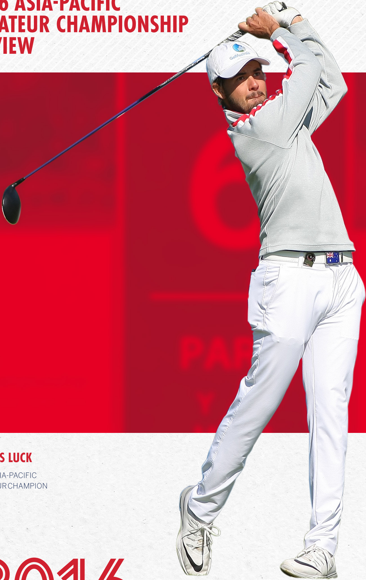
CURTIS LUCK 2016 ASIA-PACIFIC AMATEUR CHAMPION