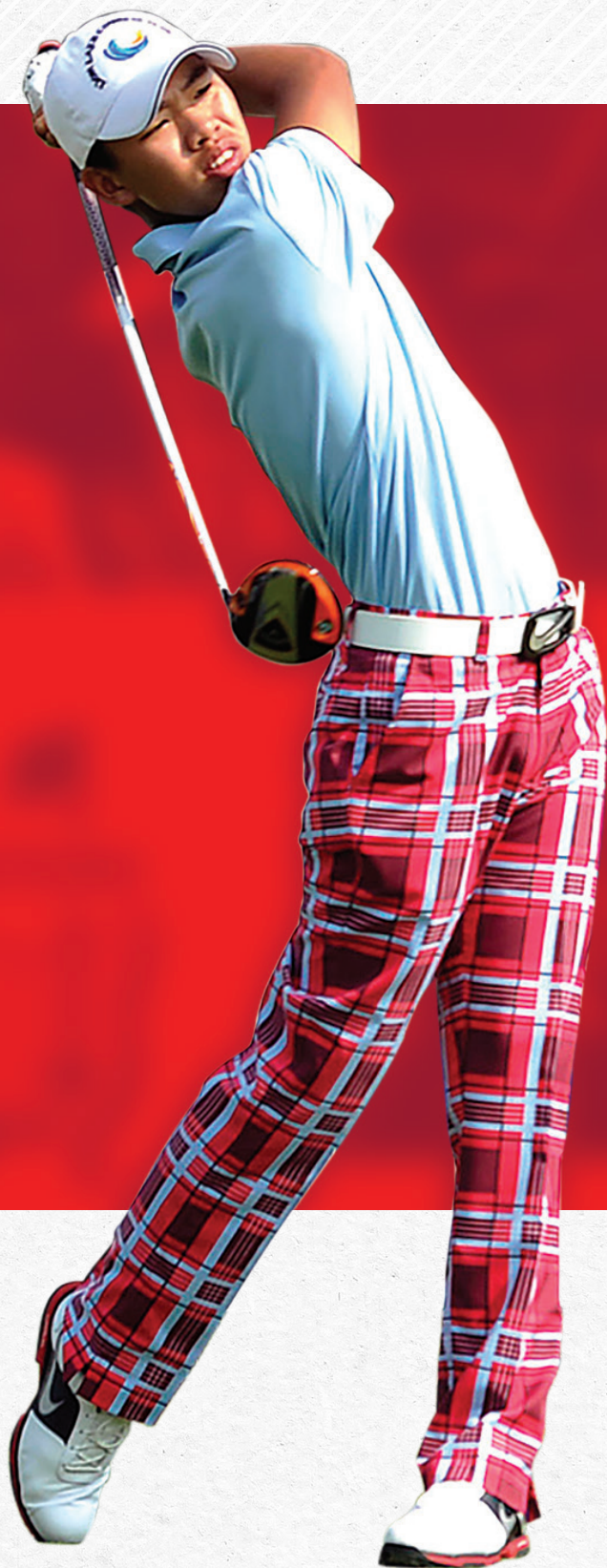
TIANLANG GUAN 2012 ASIA-PACIFIC AMATEUR CHAMPION