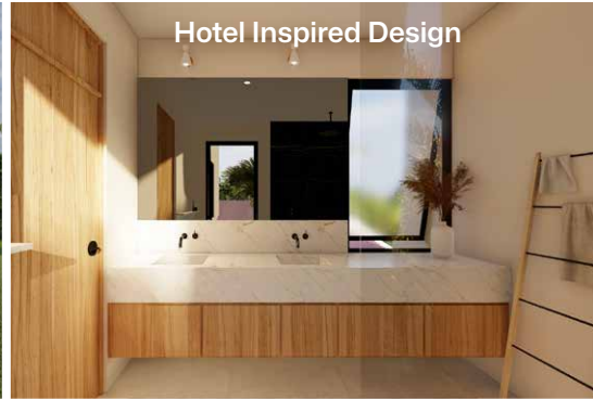
Hotel Inspired Design