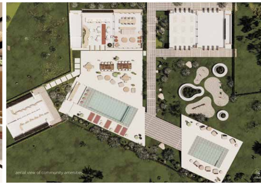
aerial view of community amenities

Guests will enjoy a rewarding resort like paradise