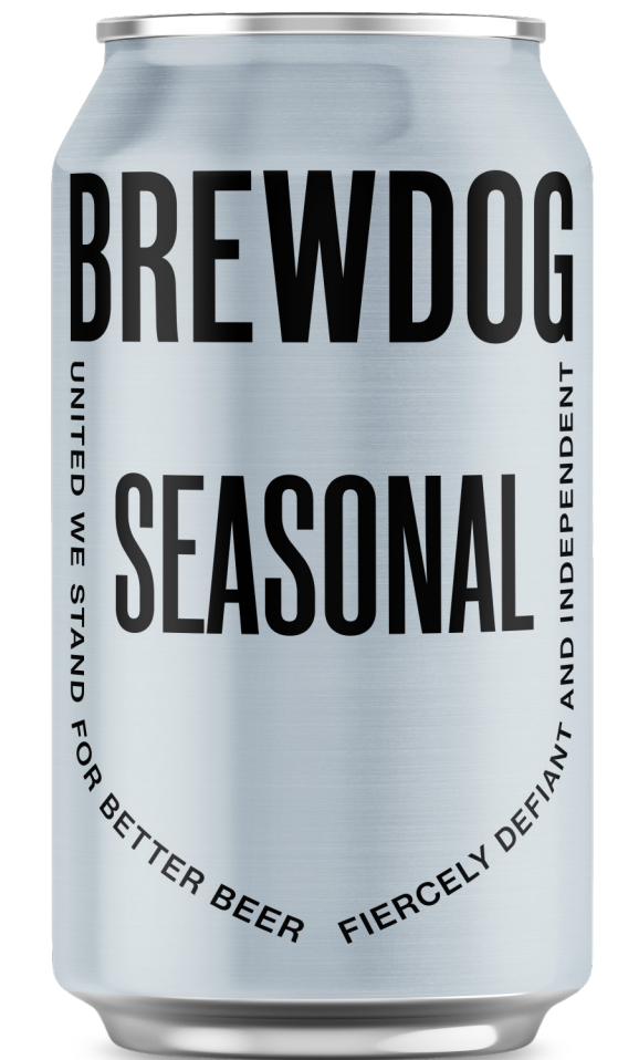
LOOKING FOR SOMETHING ELSE? ASK OUR TEAM! SEASONAL BEER