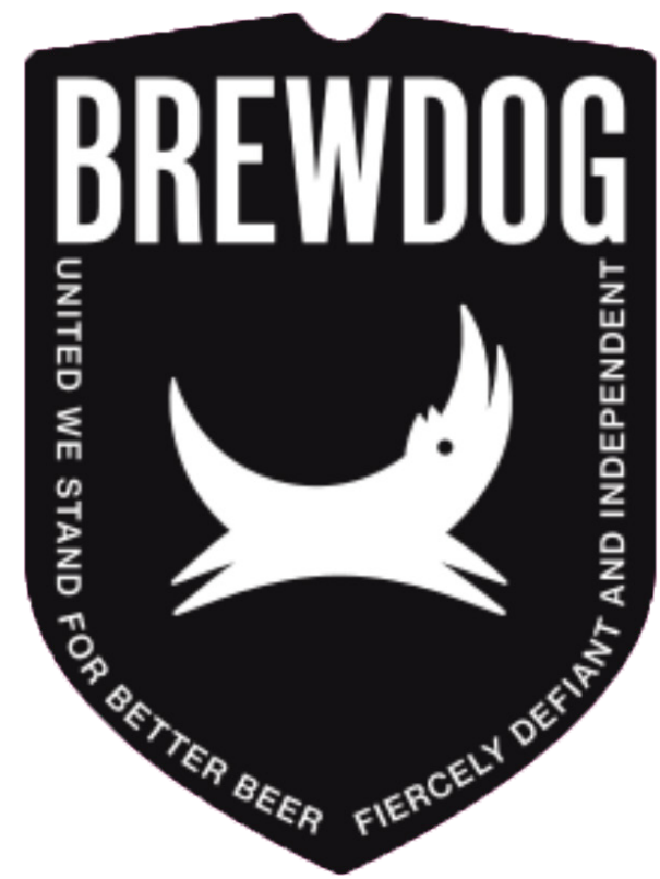
SHIELD STICKER PACK (125)