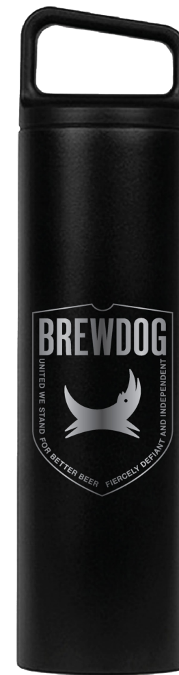
MIIR 20oz WATER BOTTLE