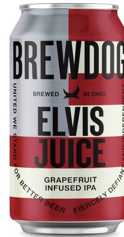
ZESTY. CITRUS. JUICY. FRUITED IPA