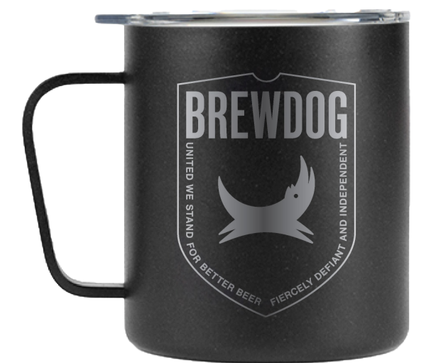
MIIR 12oz CAMP CUP