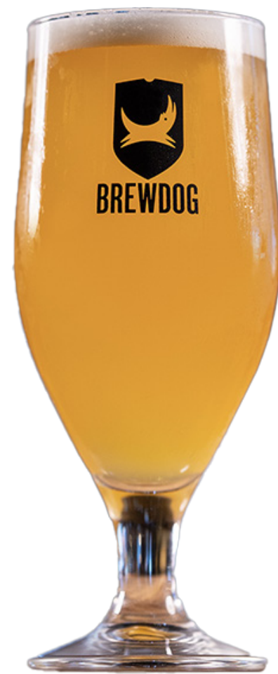
12oz STEMMED GLASS