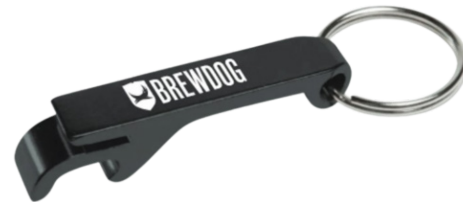
BOTTLE & CAN OPENER