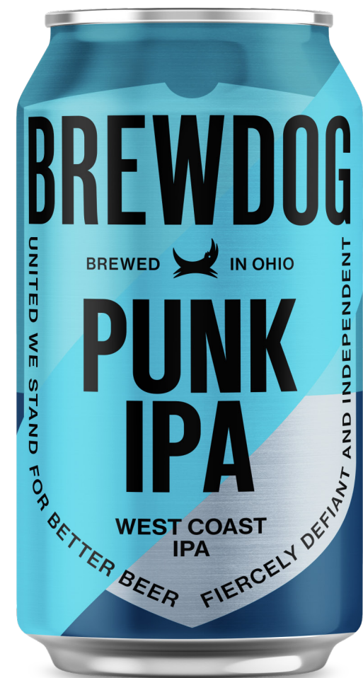
HOPPY. DANK. CITRUS. WEST COAST IPA