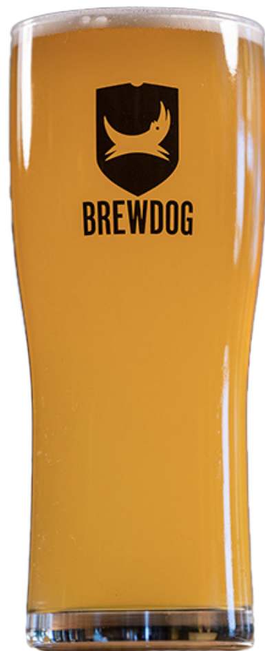
16oz PINT GLASS