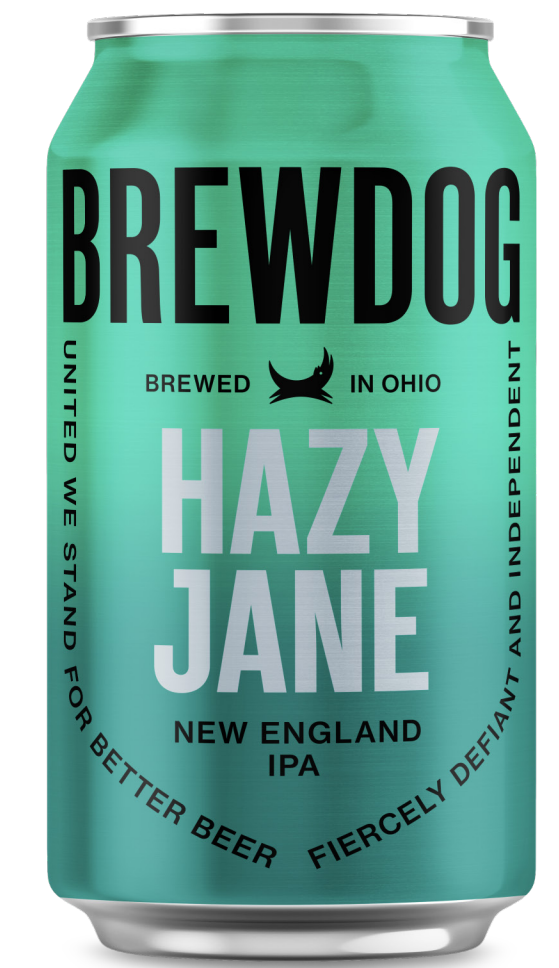
JUICY. TROPICAL. GRASSY. NEW ENGLAND IPA