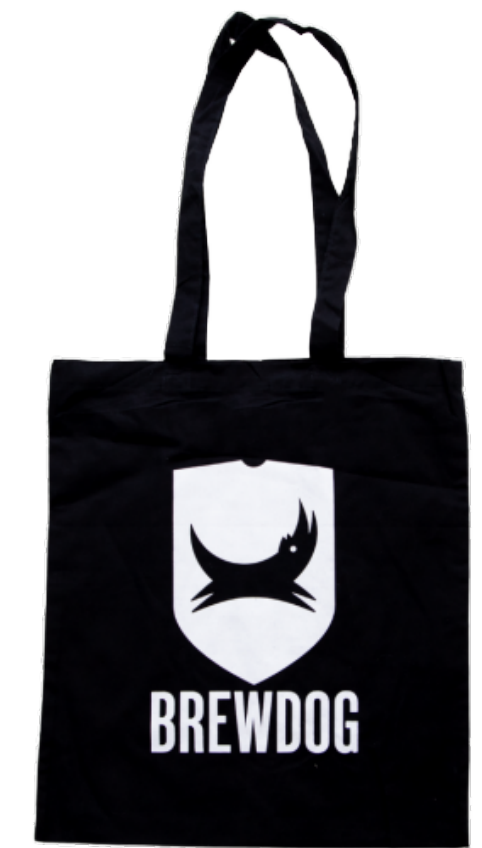
CANVAS TOTE BAG