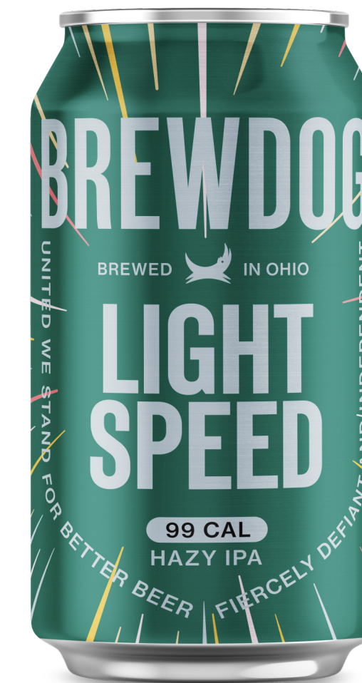
LIGHT. PEACHY. FLORAL. 99 CAL IPA