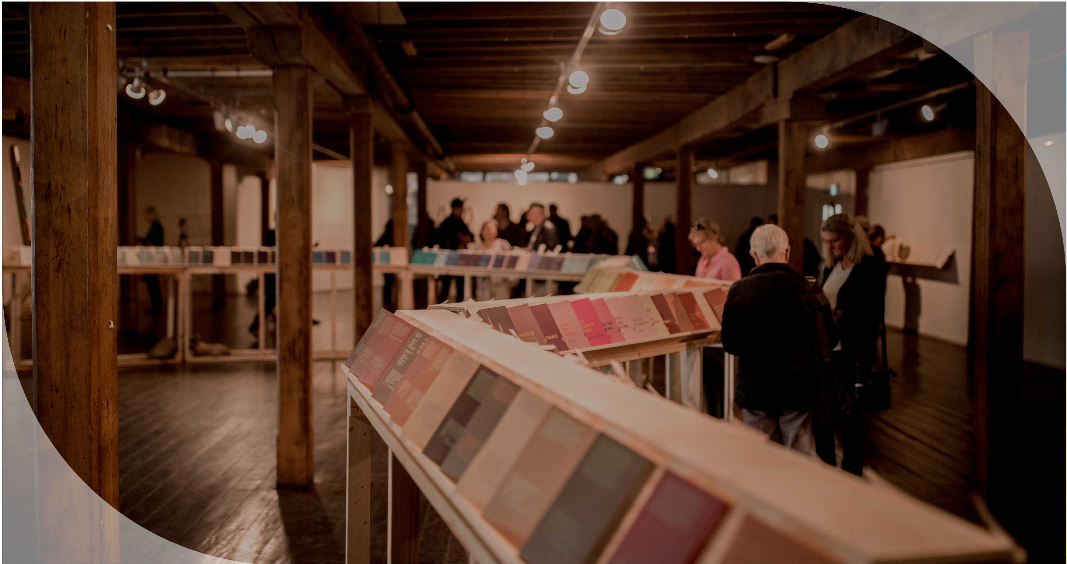
Image: Colour matching print samples for The People's Library with Werner's Nomenclature of Colours. 2018. A Published Event.