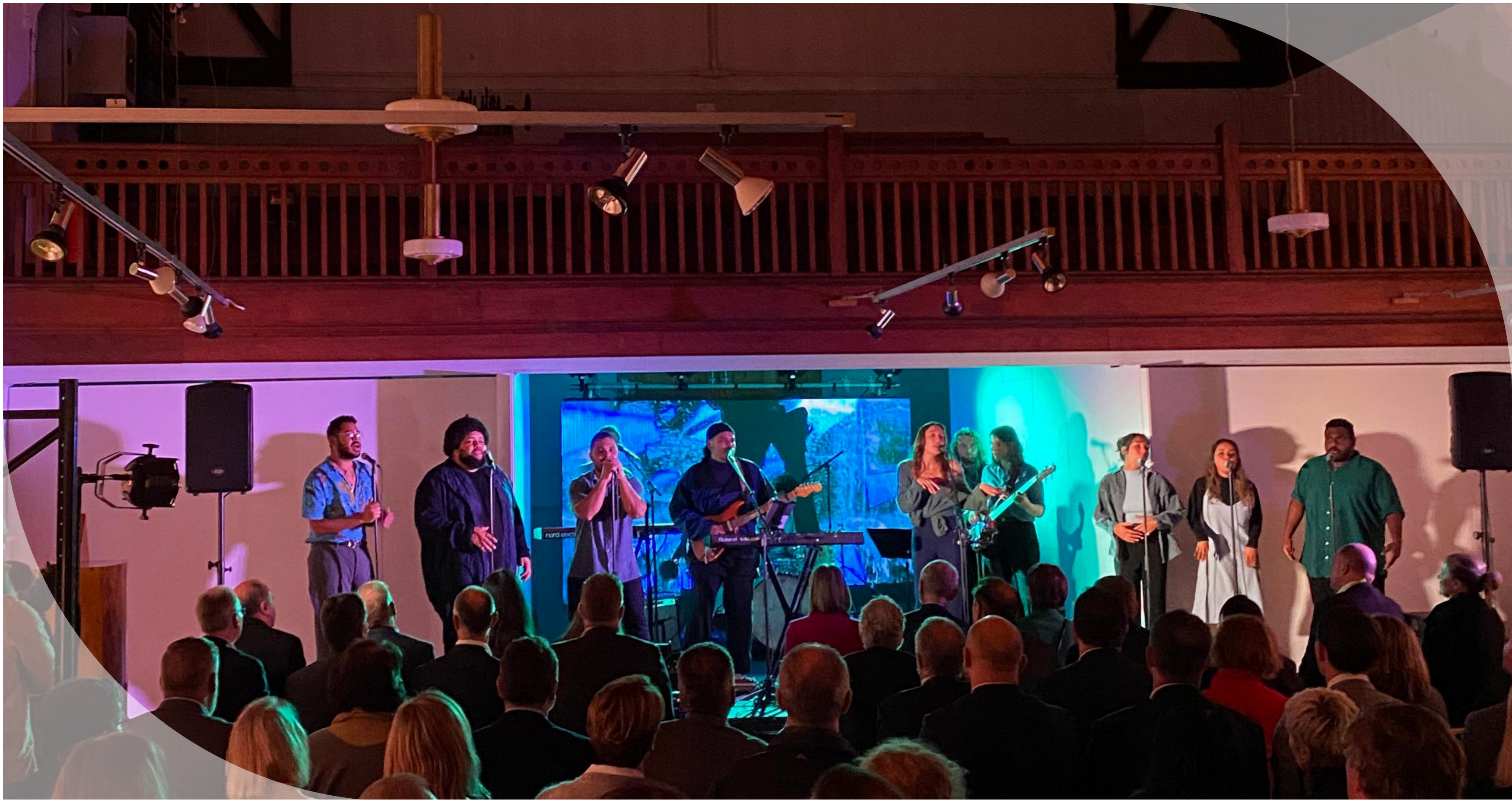
Image: When Water Falls performs in Price Hall