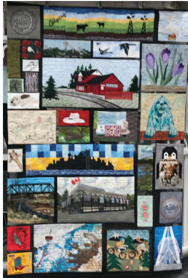
Quilted Mouse Guild

Please come out and visit the guilds, you might just find a new passion in life!