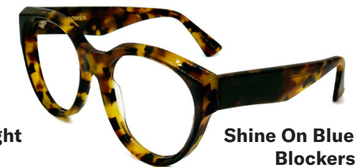
Shine On Blue Light Blockers SAIBBG2 | $250