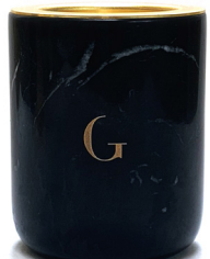
Dirt: Earthy Scented Marble Candle GILDBMC1 | $88