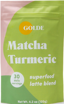
Jitter-Free Energy Matcha Tea GOLDMA1 | $29