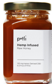
Immune Boosting Honey CALIRC1 | $42