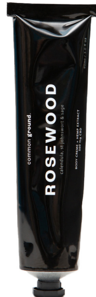
Restorative Hand Cream COMRBC1 | $50