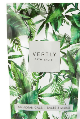
Soothing Recovery Bath Soak VERTBS1 | $29