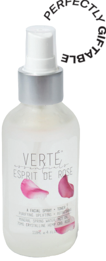
Hydrating Rose Facial Spritz VERRFS1 | $42