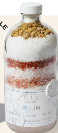
Mind + Body Stress Relief Bath Soak VERLF1 | $55