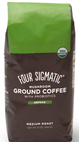
Digestive Balancing Coffee FOURPC1 | $20

POPLAR™ defining the essential toolkit to help you feel better. Shop now at www.shop-poplar.com