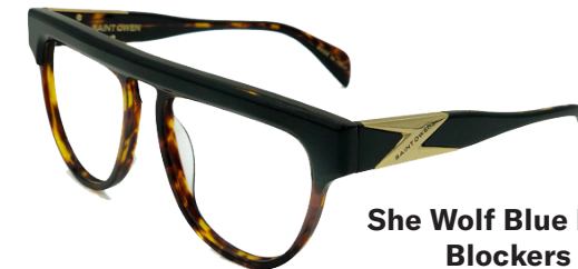
She Wolf Blue Light Blockers SAIBBG1 | $250

Equally important is protecting those beauties from blue light. With the compounded amount of time we are spending on screens these days, blue light blockers are a must.