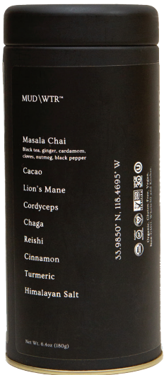
Body + Brain Energizing Chai Tea MUDWTR1 | $50

And of course wellness travels with me always, right now I’m loving Plant People Full Body Support Daily CBD Tincture .