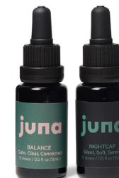
A Set of Day + Night Tinctures JUNADU1 | $74