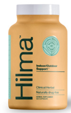
Indoor/Outdoor Sinus Relief Capsule HILSR1 | $28

Let the plant aromas of spa-quality lavender and hemp extract ground and decompress you.