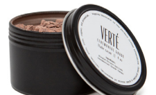
Mood + Energy Lifting Sipping Chocolate + Cacao Powder VERCA1 | $22

POPLAR™ defining the essential toolkit to help you feel better. Shop now at www.shop-poplar.com