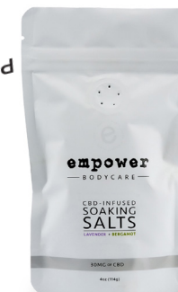
Detoxifying Bath Soak EMPBS4 | $12