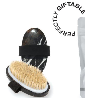
Circulation Increasing Dry Brush GILDDB1 | $88