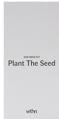
Balancing Ear-Seed Acupressure WTHNES1 | $45