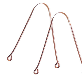
Detoxifying Tongue Cleaner (2 Pack) TONGTC1 | $25