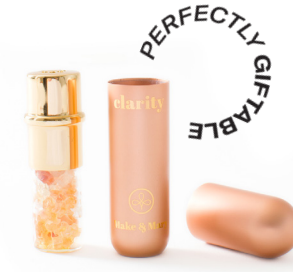
Inhale a Clearer State of Being MAKCL1 | $22

Stress-reducing ingredients like ashwagandha support your ability to take deep grounding breaths.