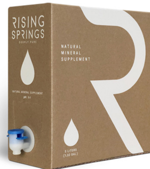
Pure Natural Mineral Supplement Water (3 month subscription) RISNW3 | $30