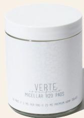
Gently Exfoliating Cleansing Wipes VERGCW1 | $42