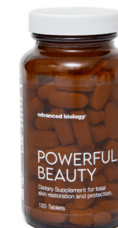
Skin Restoration + Protection Supplement ADVPS1 | $80