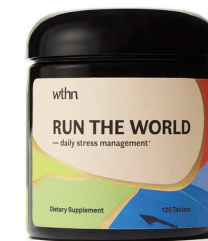
Herbal Stress Management Tablets WTHNRW1 | $45