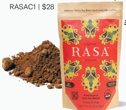
Protective Chocolatey Antioxidant Coffee Alternative RASAC1 | $28

As if detoxifying with a good sweat session wasn’t enough, try delivering nutrients to muscles and boosting your metabolic rate with a personal infrared sauna. Studies also show mood boosting, pleasure inducing dopamine and serotonin are released in a single session.