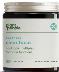
Herbal Brain Focus Supplement PLACF1 | $35