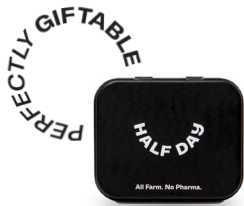
Smokable Instant Stress Release HALFDJ1 | $10