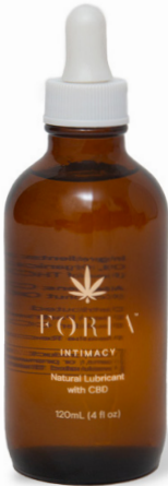
Stimulating + Soothing Vaginal Lubricant FORSSL1 | $48

Joy...Sex.... It’s not hard to see the connection. A bedroom essential, this oil-based lubricant is a natural way to add silky glide to all your adventures (solo or with a partner). Enhance intimacy with the soothing and activating effects of CBD delivered directly to the most intimate areas. This luscious oil is light, non-greasy, and gently moisturizing.