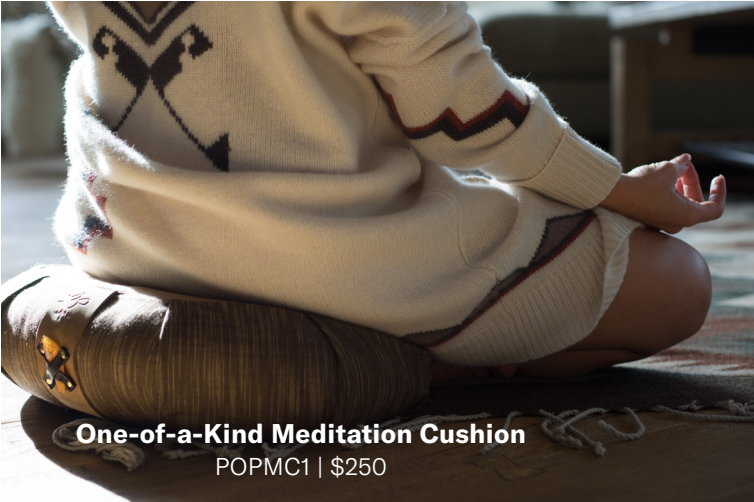
One-of-a-Kind Meditation Cushion POPMC1 | $250