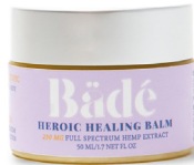
Pain Alleviation Balm BADHB1 | $58