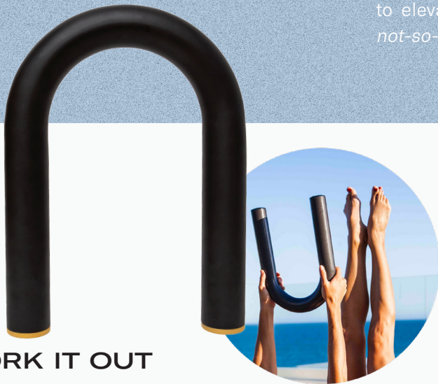
An Elevated Workout Bar EQUBAR4 | $129

Seasonal effectiveness disorder is real. Depression is on the rise. Frankly, there is just some very real b.s. we are up against these days and we all deal with it differently. The numbing effects of prescriptions tend to mute many subtleties of life, the subtleties that help guide our decisions, even good ones; whereas the gentle effects of more natural options are designed to elevate your state of joy, allowing the not-so-good to be forgotten. Pretty cool!