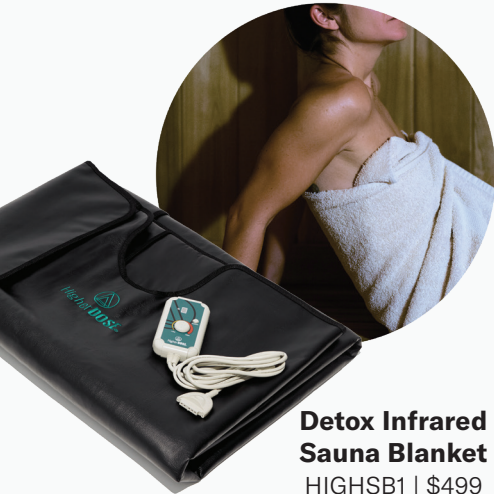
Detox Infrared Sauna Blanket HIGHSB1 | $499