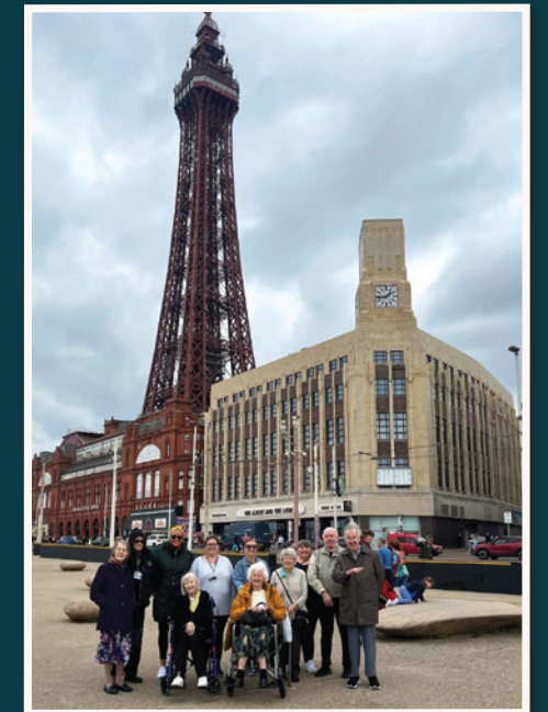
Pictured: Resident and colleagues from Belong Wigan pictured outside Blackpool Tower.

A stroll down the famous Golden Mile prom (prom, prom) provided the perfect backdrop for sharing happy memories of the town and the Blackpool Tower. Later, they had chance to indulge themselves with a chippy tea, followed by plenty of ice cream!