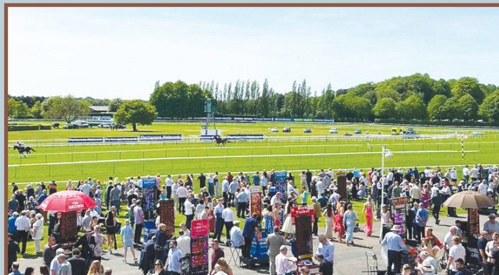
Pictured: Haydock Racecourse