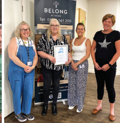
Belong at Home, Crewe