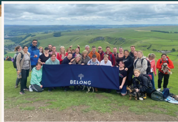
More than 40 Belong colleagues completed the hike in the scenic Peak District.