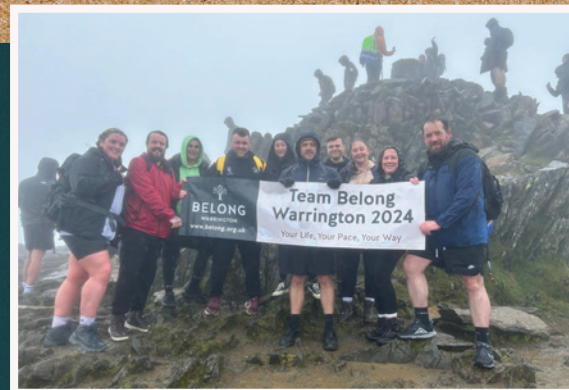
Pictured right: The team raise the 'flag' for Belong Warrington.

Stay tuned for news on future challenges and how you can join the Belong team.