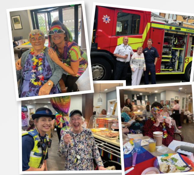
Belong customers enjoy the community celebrations, joined by Cheshire Police and Cheshire Fire and Rescue.

Belong's pride initiative won the Volunteer Award at Cheshire Pride Awards 2023 for the work supporting the local, older LGBTQ+ community. Across the Belong group of care village and home care services in the North West and West Midlands, the not-for-profit organisation has implemented the Skills for Care LGBTQ+ learning framework for its teams, equipping them with the knowledge, values and best practice to support its lesbian, gay, bisexual, trans gender and other customers, whose needs can differ from others.