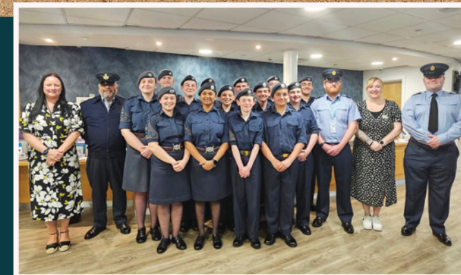
Pictured: B RAF Cadets from 316 Leigh Squadron ATC

The pair of care team leaders were selected to attend along with invitees from other not-for-profit organisations, charities and societies, as well as people put forward by the government, armed services, the Church and other faiths.