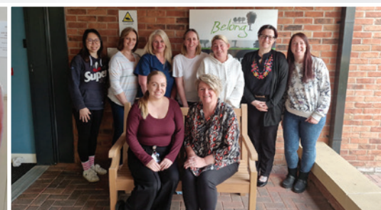
Belong at Home, Warrington