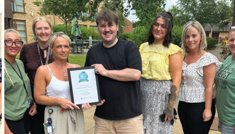
Belong at Home, Wigan