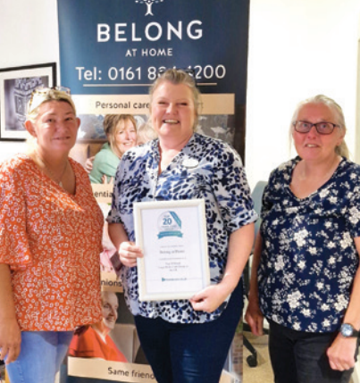
Belong at Home, Didsbury & Altrincham