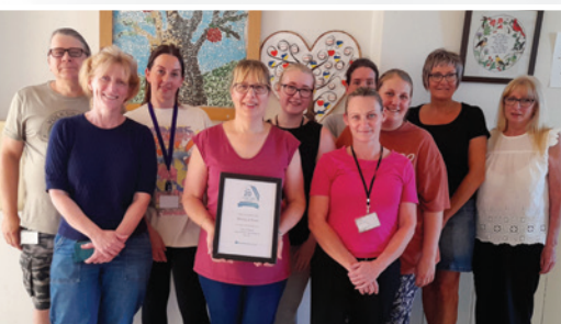
Belong at Home, Macclesfield team