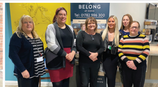
Belong at Home, Newcastle-under-Lyme