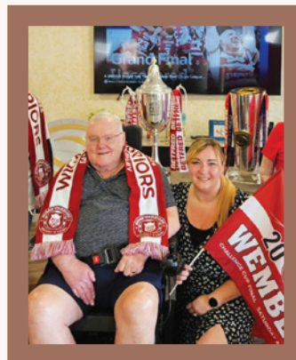
Challenge Cup excitement reaches fever pitch Page 11