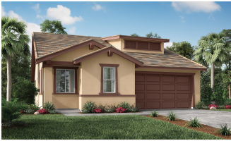
A - Stucco Bungalow