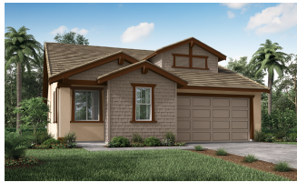
B - Craftsman