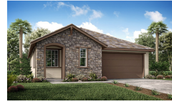
A - Stucco Bungalow