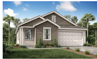
C - Farmhouse