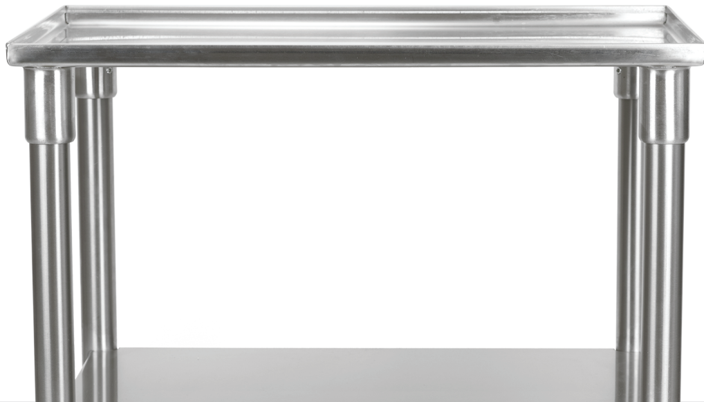
Utility Cart UT1330

The UT1330 utility cart has been specifically designed for our line of dough presses. It features 30" height, pre-drilled mounting holes to bolt your unit down for safety. Easy gliding casters allow you to move over thresholds and across carpeting.