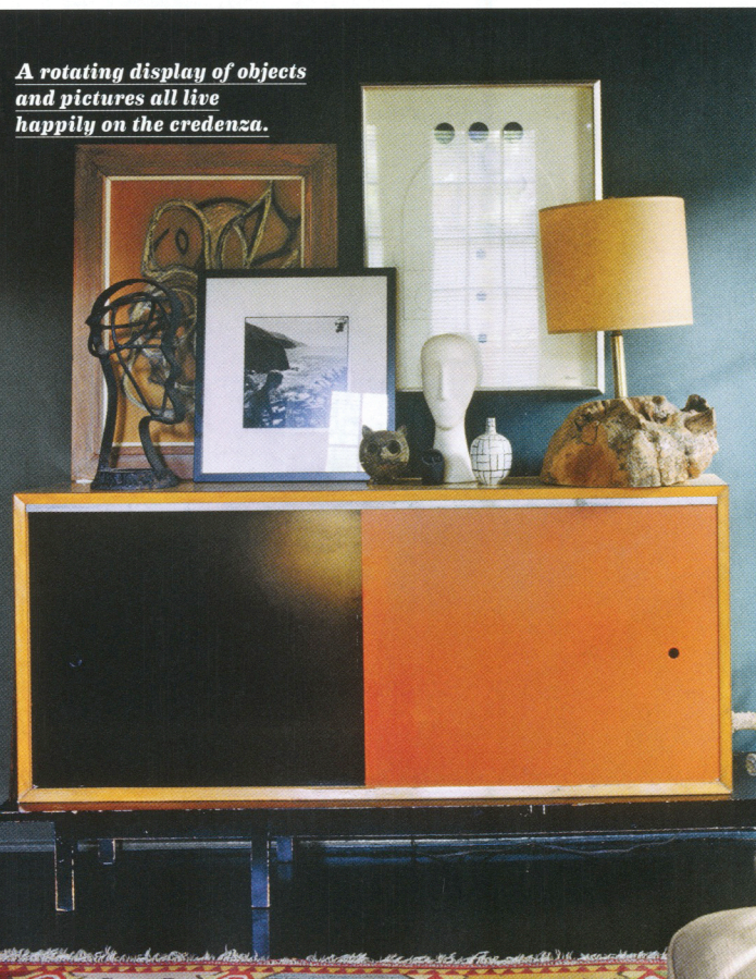
A rotating display of objects and pictures all live happily on the credenza.