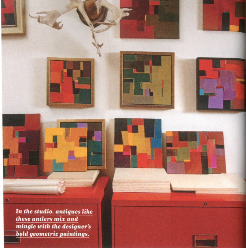
In the studio, antiques like these antlers mix and mingle with the designer's bold geometric paintings.

this page FILING CABINETS (similar to shown) "600 Series" by Sandusky Lee, three-drawer lateral, $320 each, schoolsin.com DESK (similar to shown) "Wedgwood," Reed La Plant Design, maple and walnut, $1,750, schoolhouseelectric.com CHAIR (similar to shown) Baltic birch drafting chair, $168, dickblick.com DESK LAMP (similar to shown) Robert Sonneman, vintage 1960s chrome-and-marble globe, $1,400, 1stdibs.com for similar