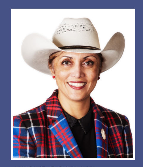
JYOTI GONDEK MAYOR, CITY OF CALGARY